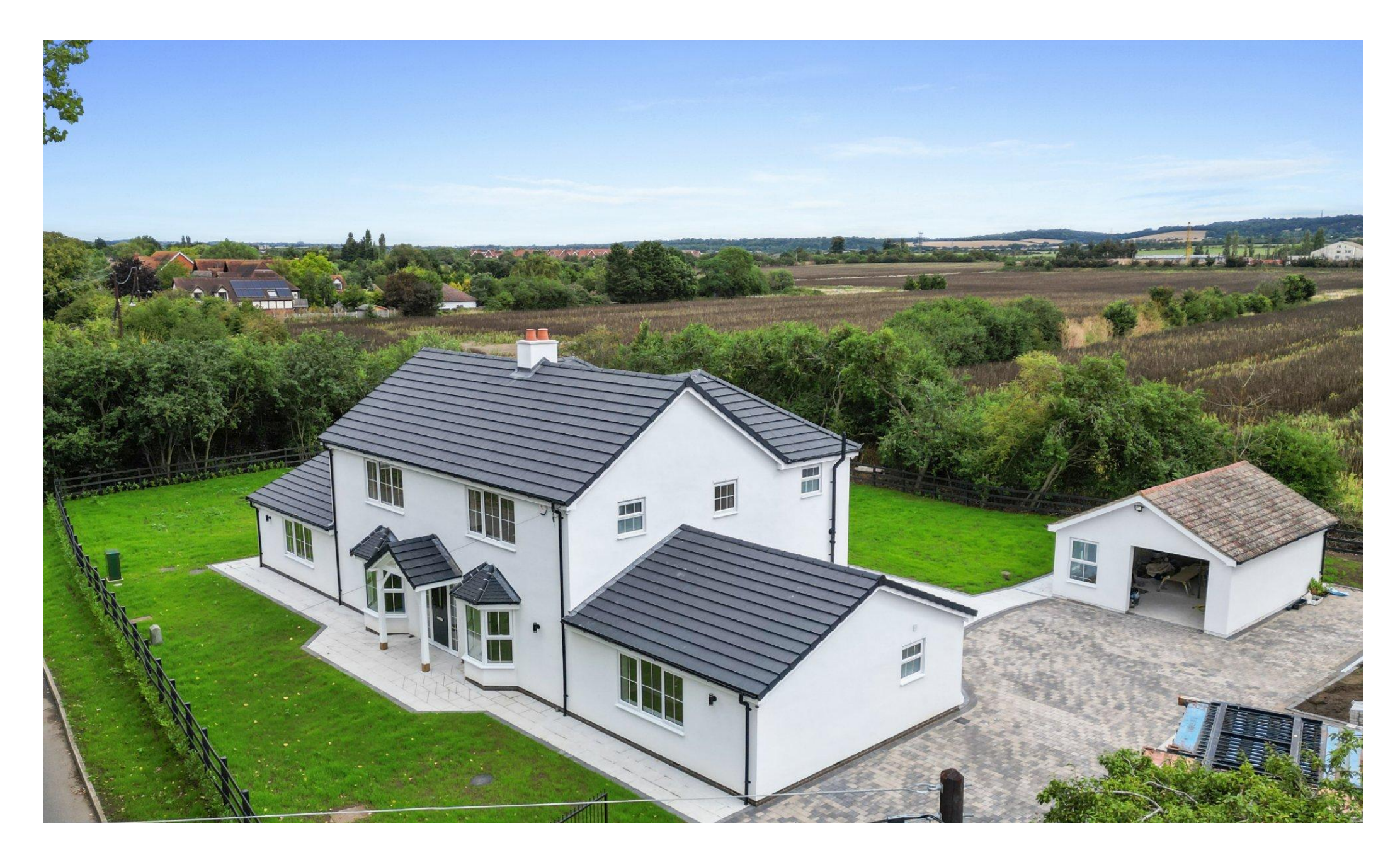
I Martins Farmhouse Church Lane | Bulphan | RM I 4 3TS