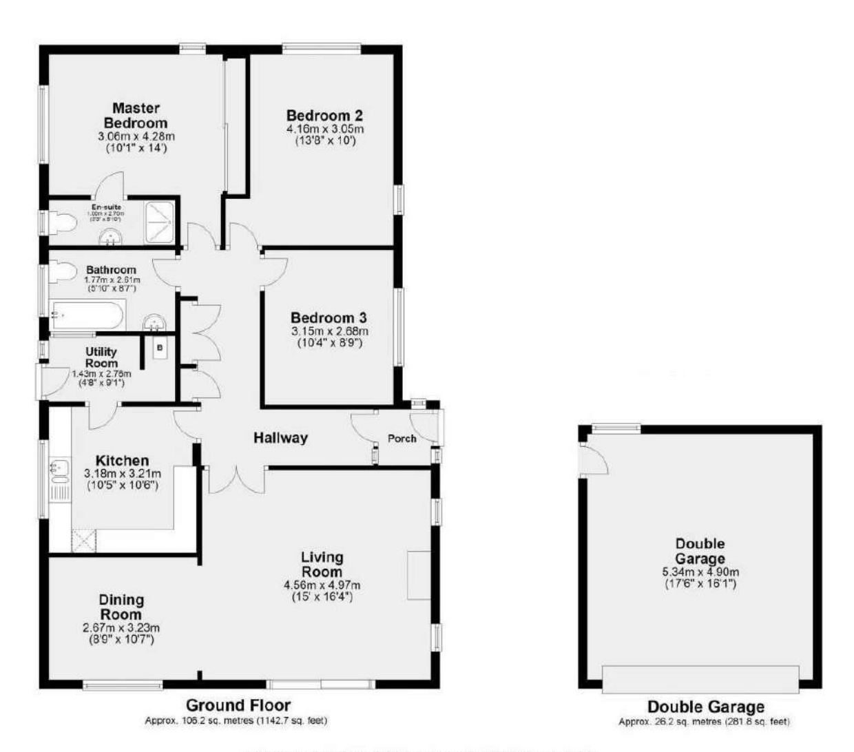
Total area: approx. 132.3 sq. metres (1424.5 sq. feet)