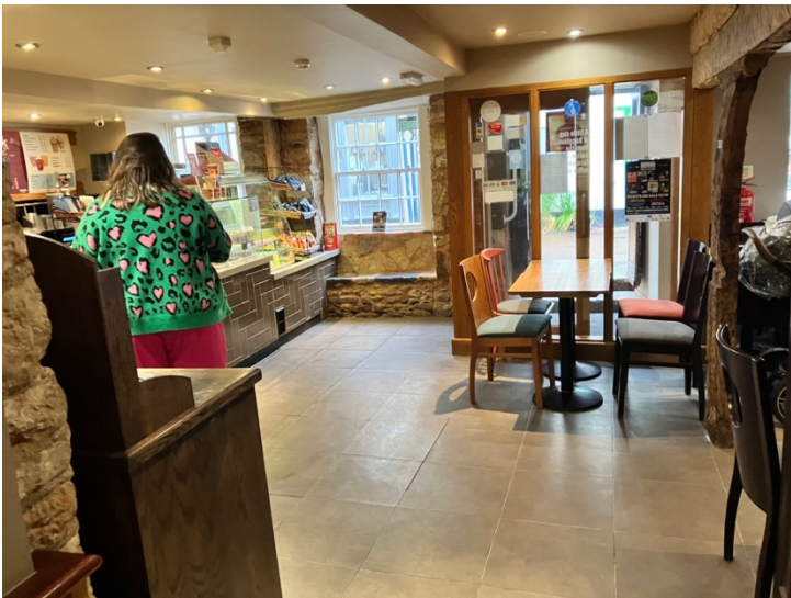
Ground Floor front of house