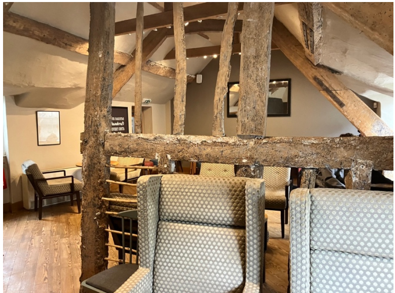
First Floor Sales