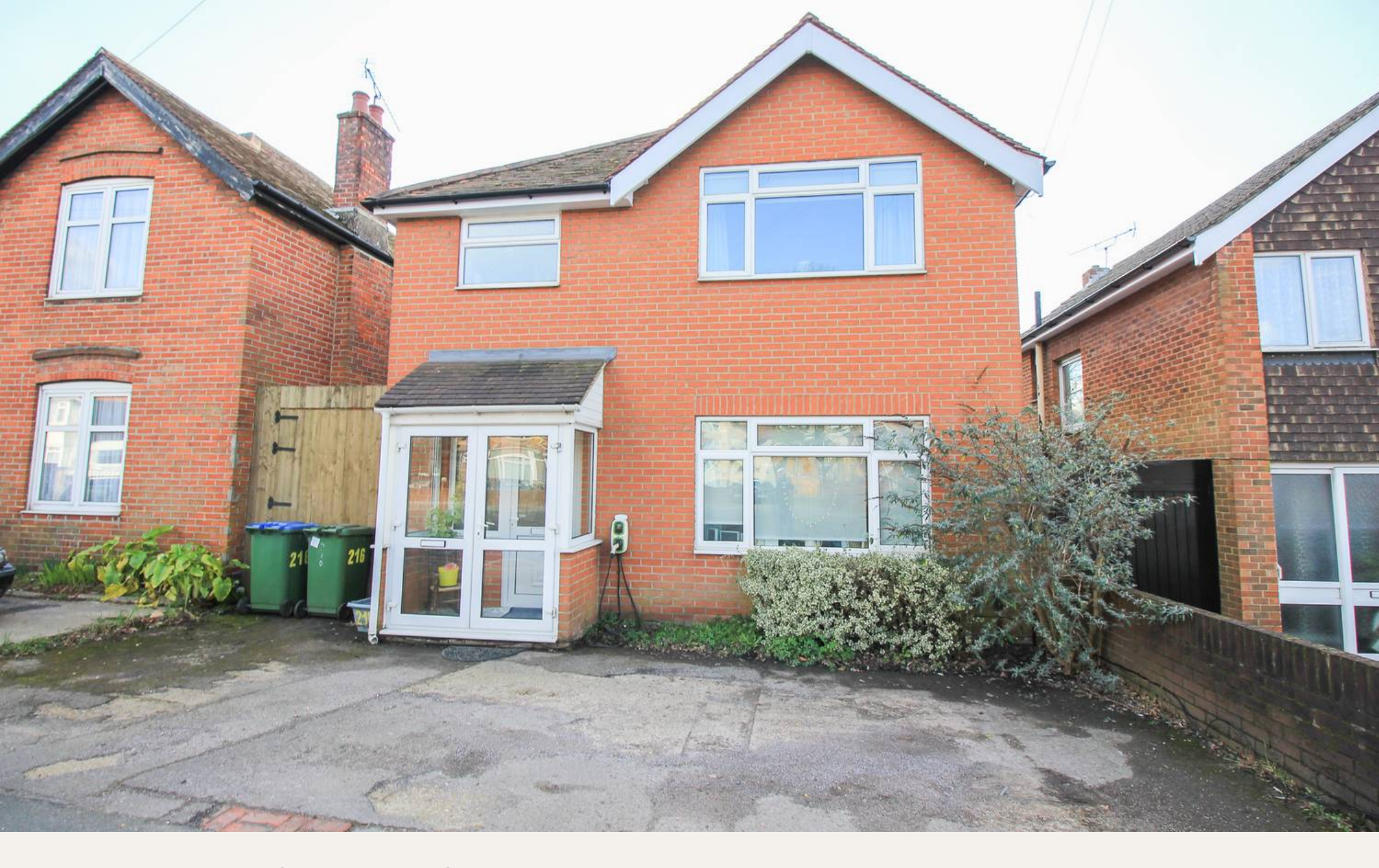
216 Bitterne Road West, Southampton - SO18 1BE Guide Price £325,000 - £340,000