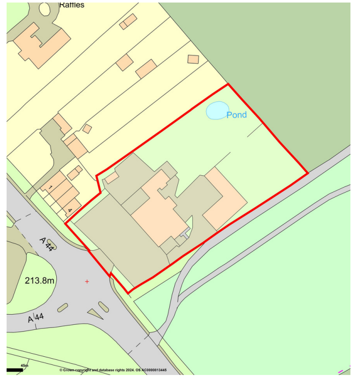
Site boundary for indicative purposes only