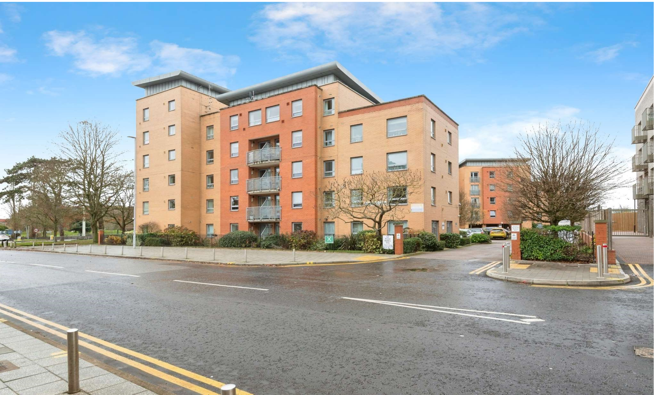
Pinetree Court Danestrete, Stevenage SG1 1YJ