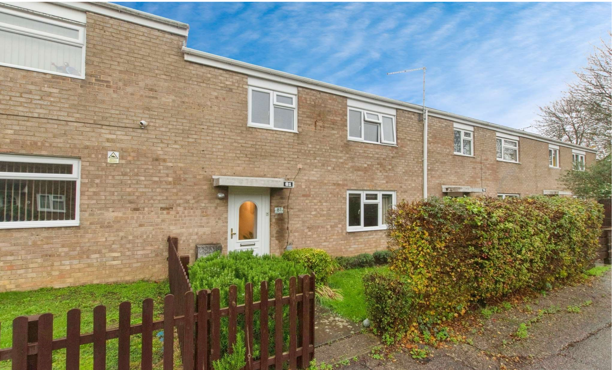
Bude Crescent, Stevenage SG1 2QL