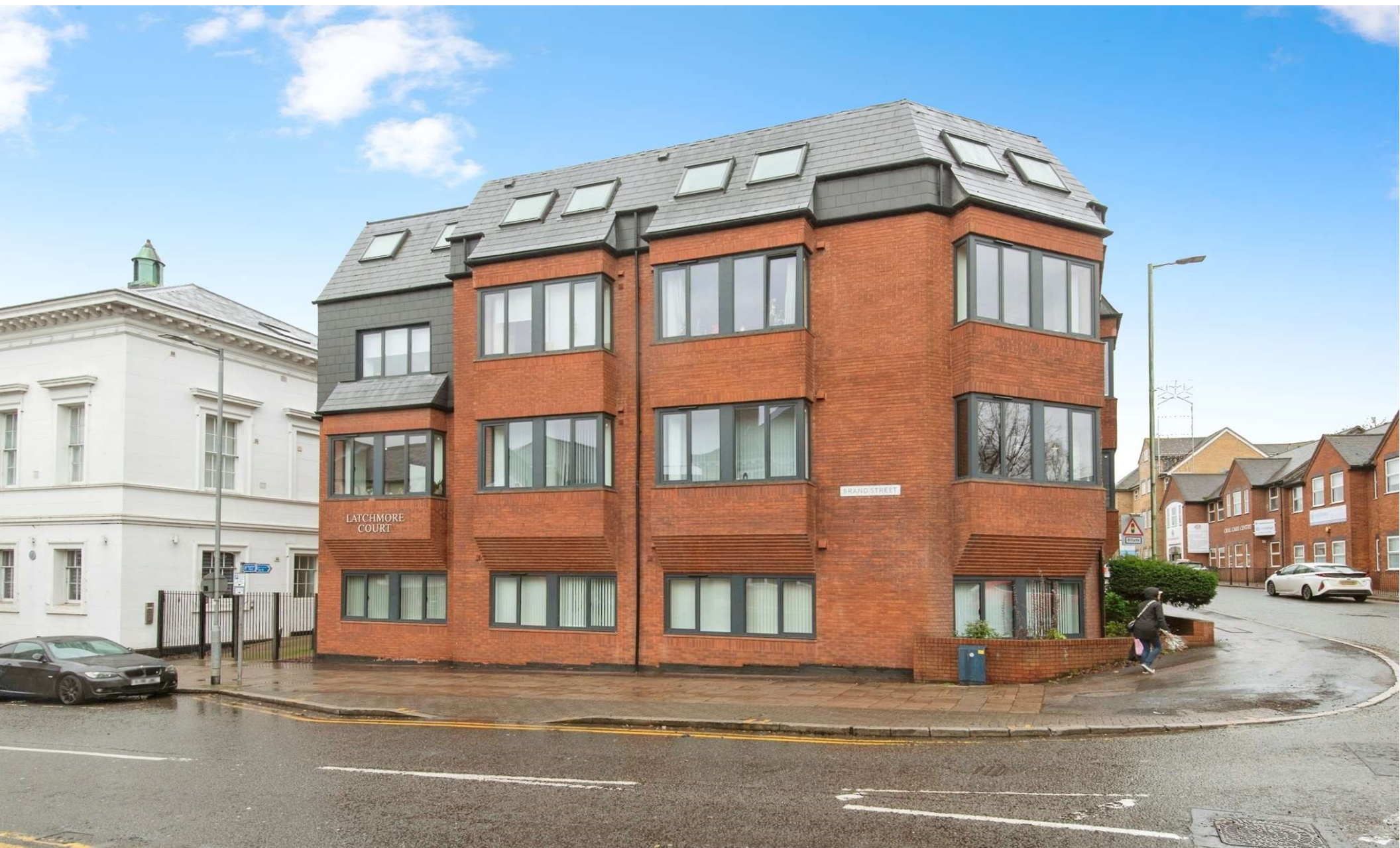
Latchmore Court Brand Street, Hitchin SG5 1HX