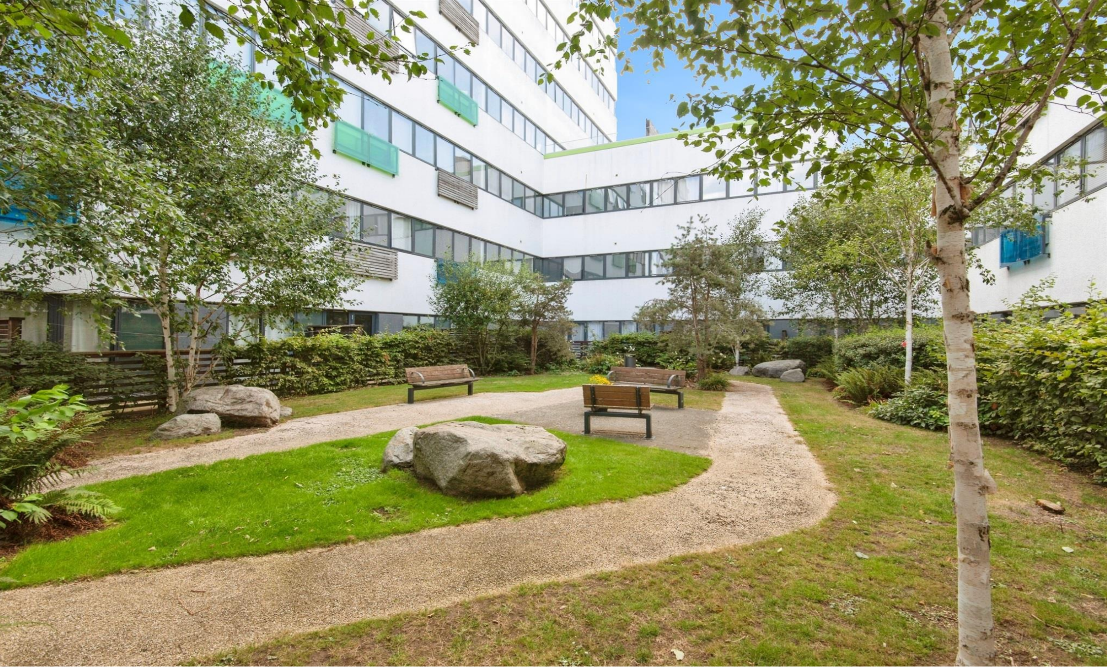
Six Hills House, Kings Road, Stevenage, SG1 1AW