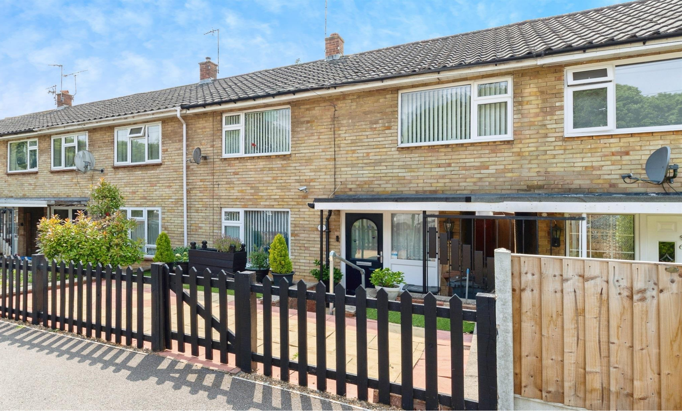
Homestead Moat, Stevenage, SG1 1UG