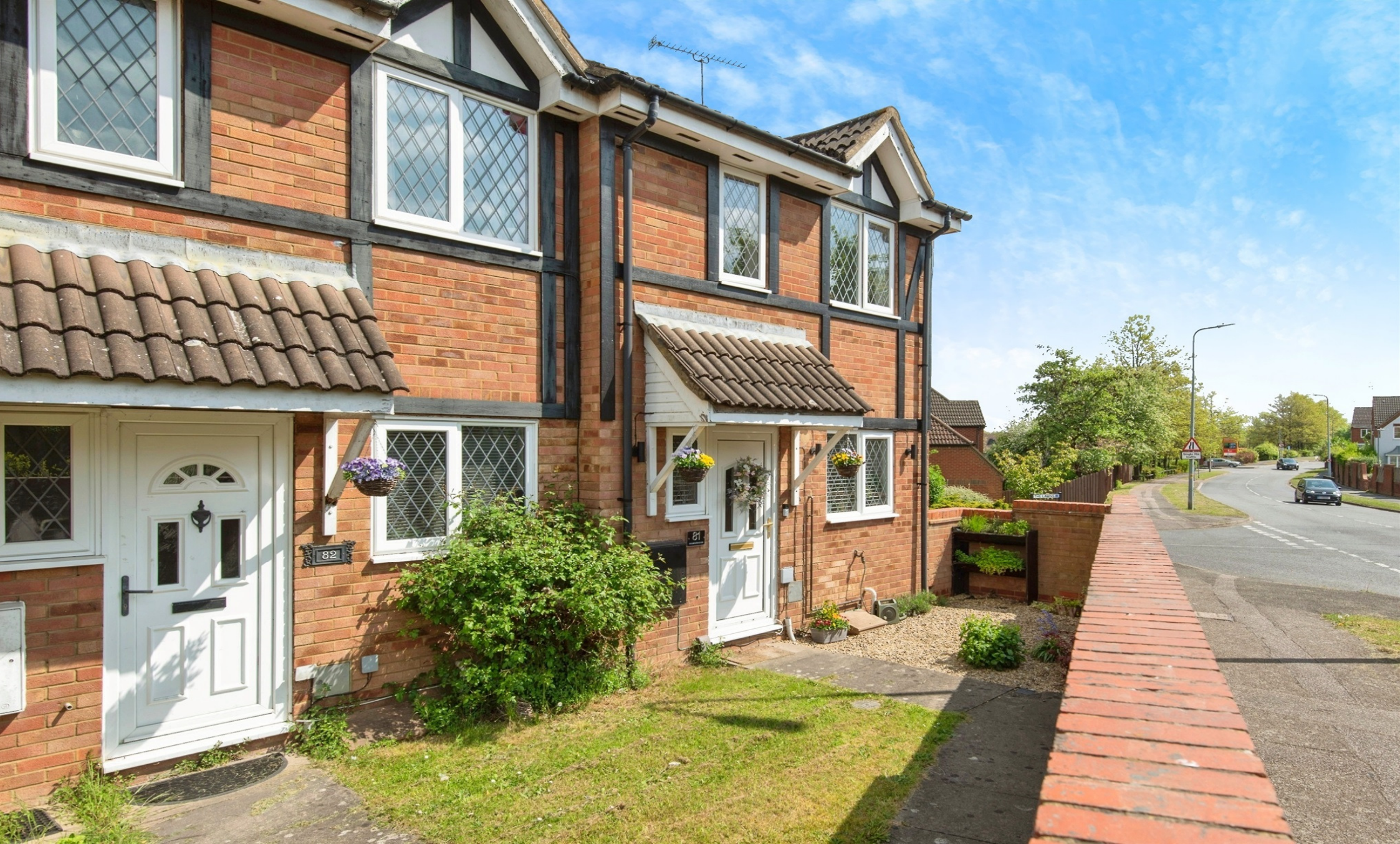
Shearwater Close, Stevenage SG2 9RX