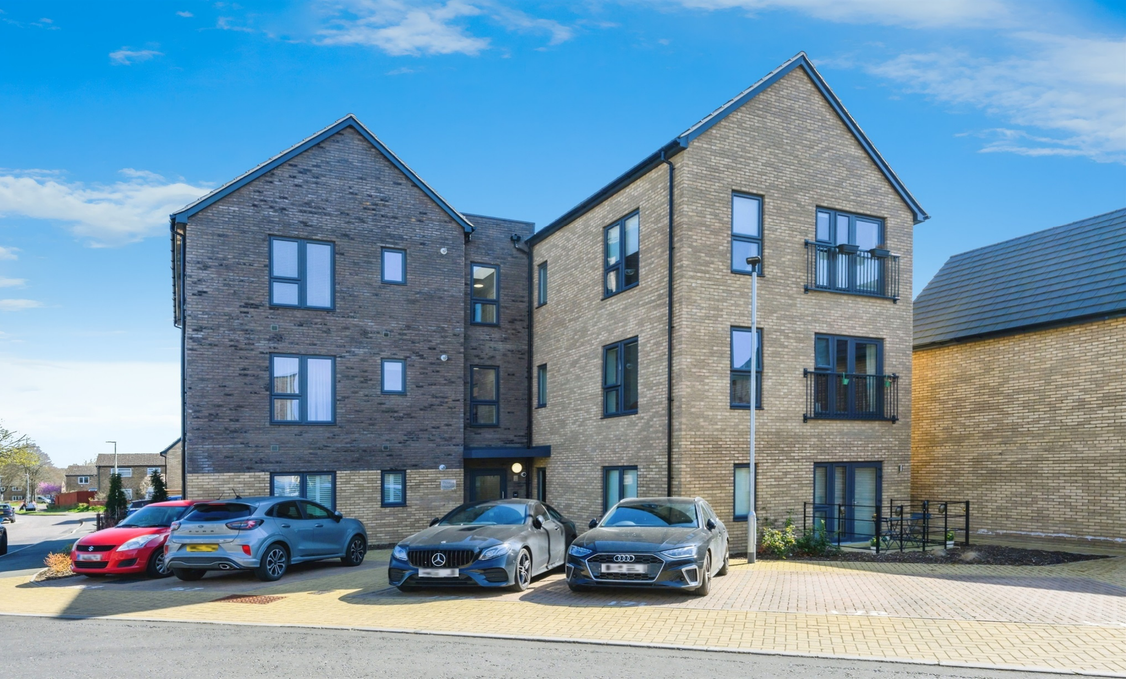
Powis House Stirling Close, Stevenage SG2 8DQ