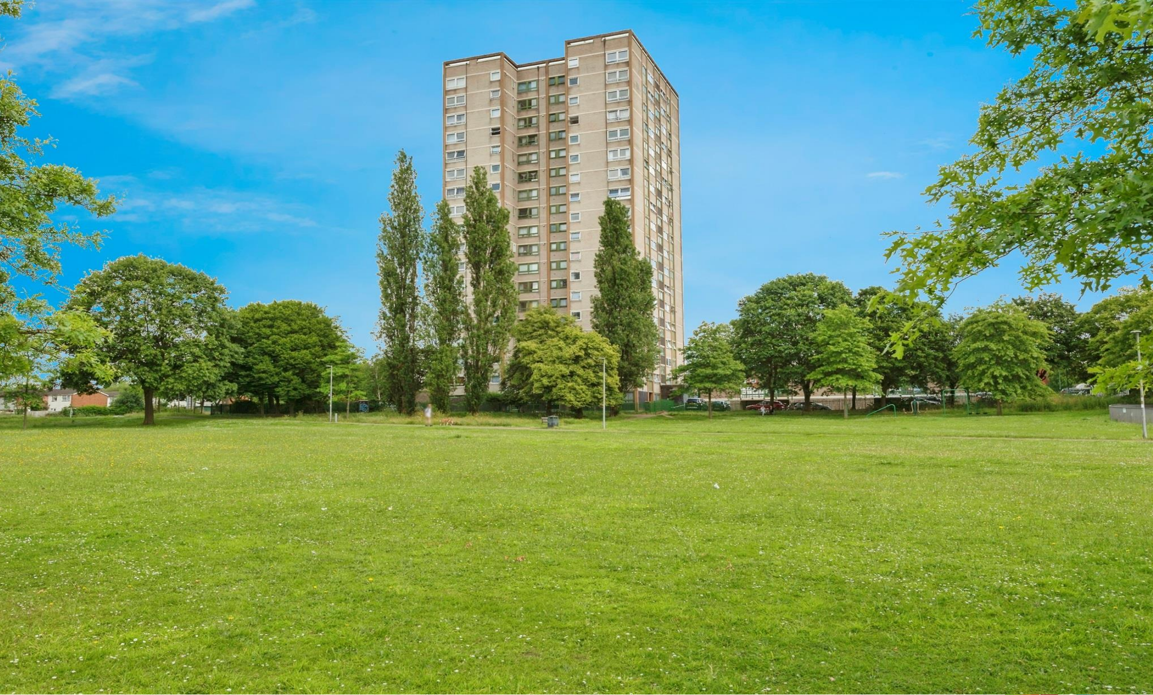
Harrow Court, Stevenage, SG1 1JT