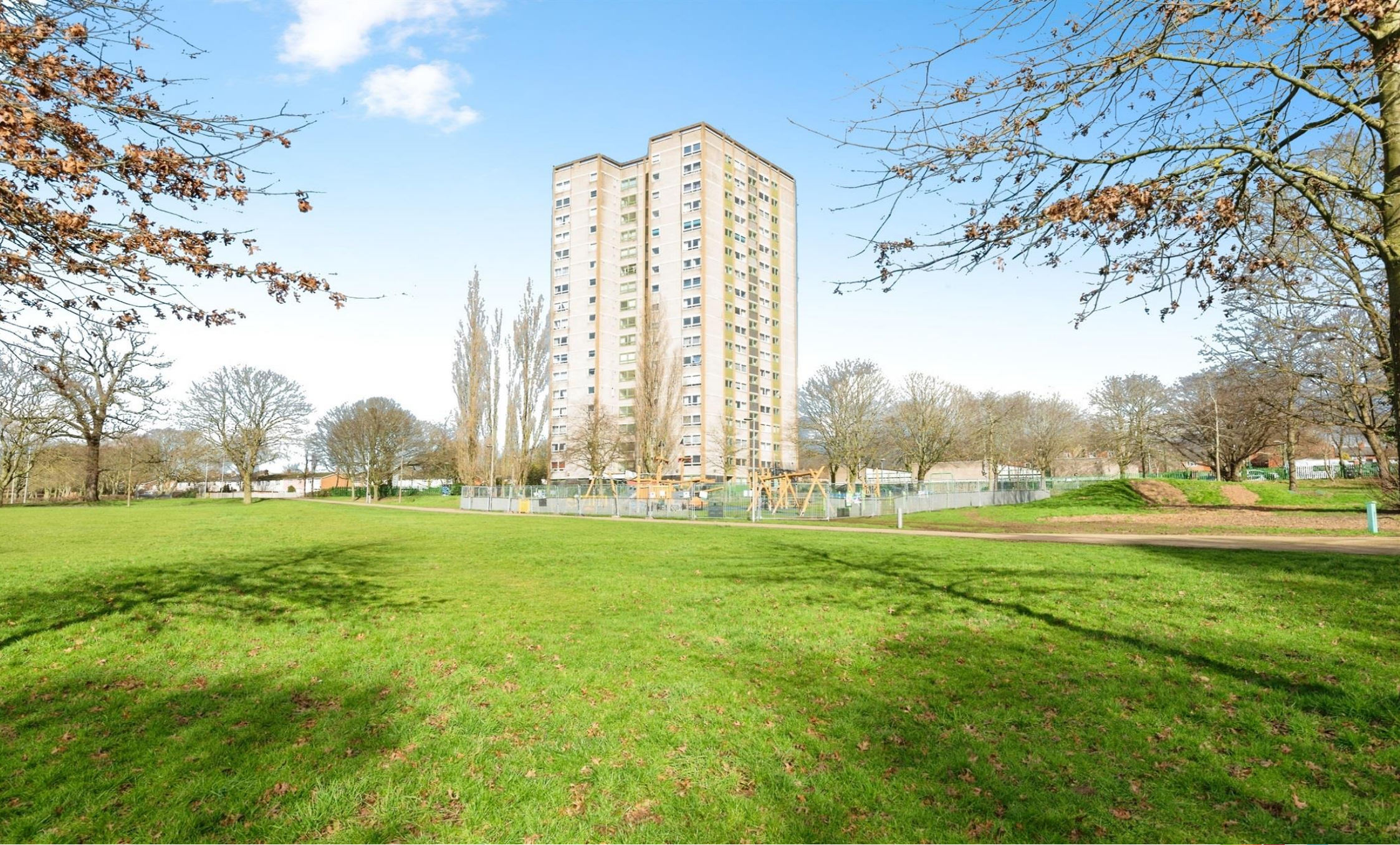
Harrow Court, Stevenage, SG1 1JT