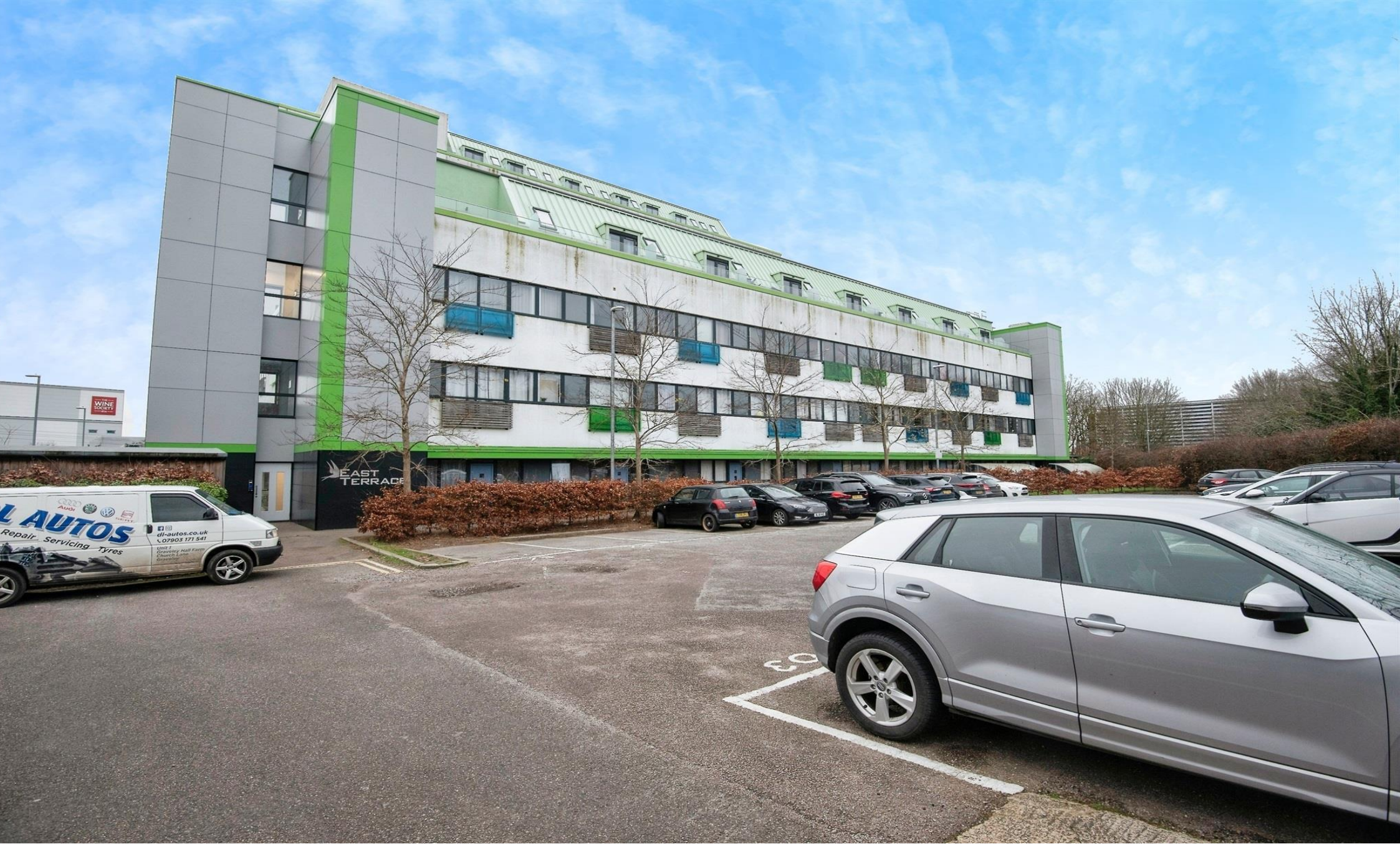
Six Hills House, Kings Road, Stevenage SG1 1AU