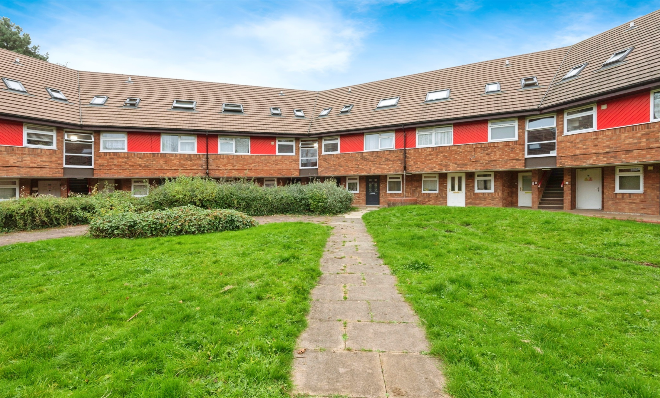
Roundmead, Stevenage SG2 9PH