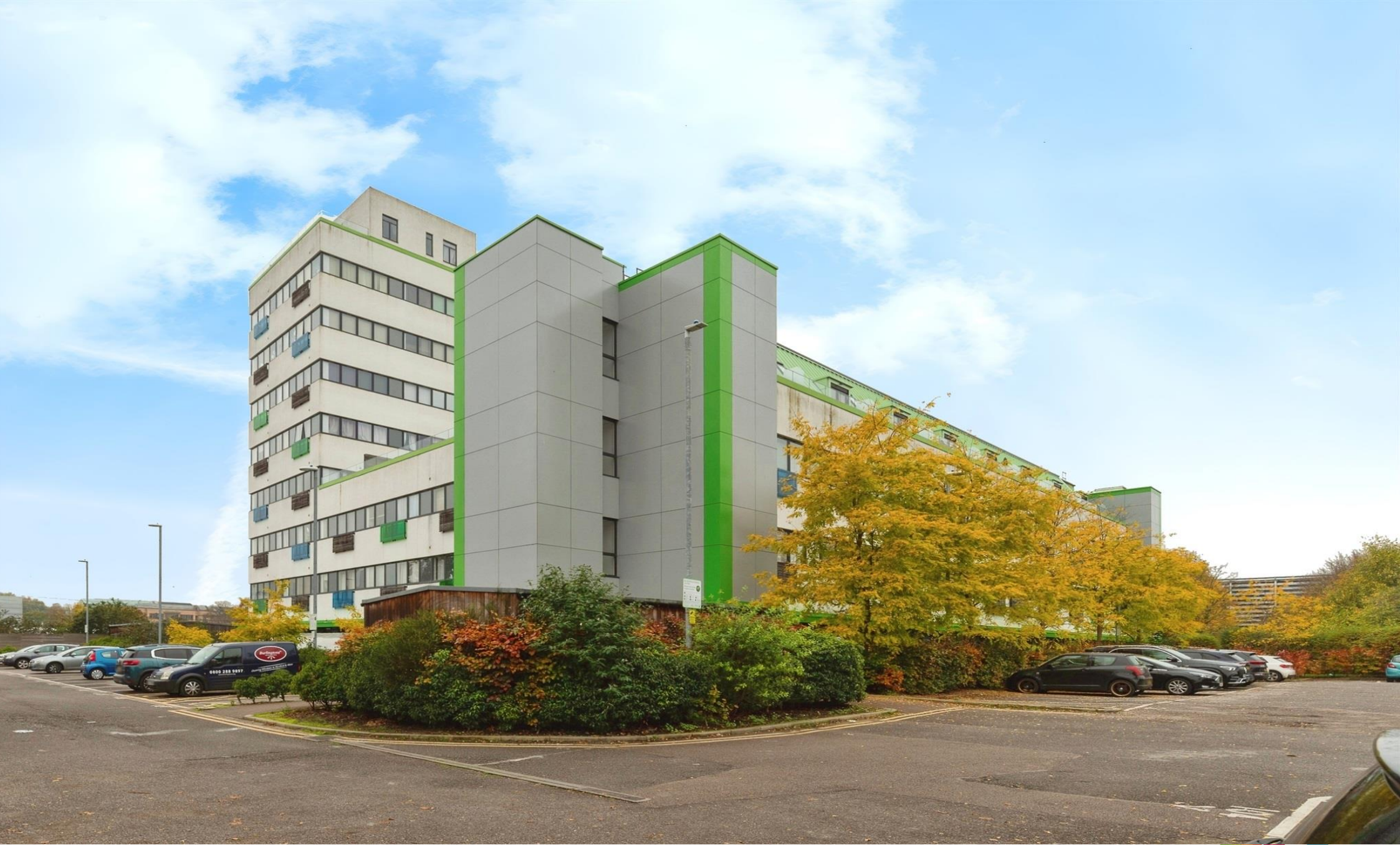
Six Hills House, Kings Road, Stevenage SG1 1AW