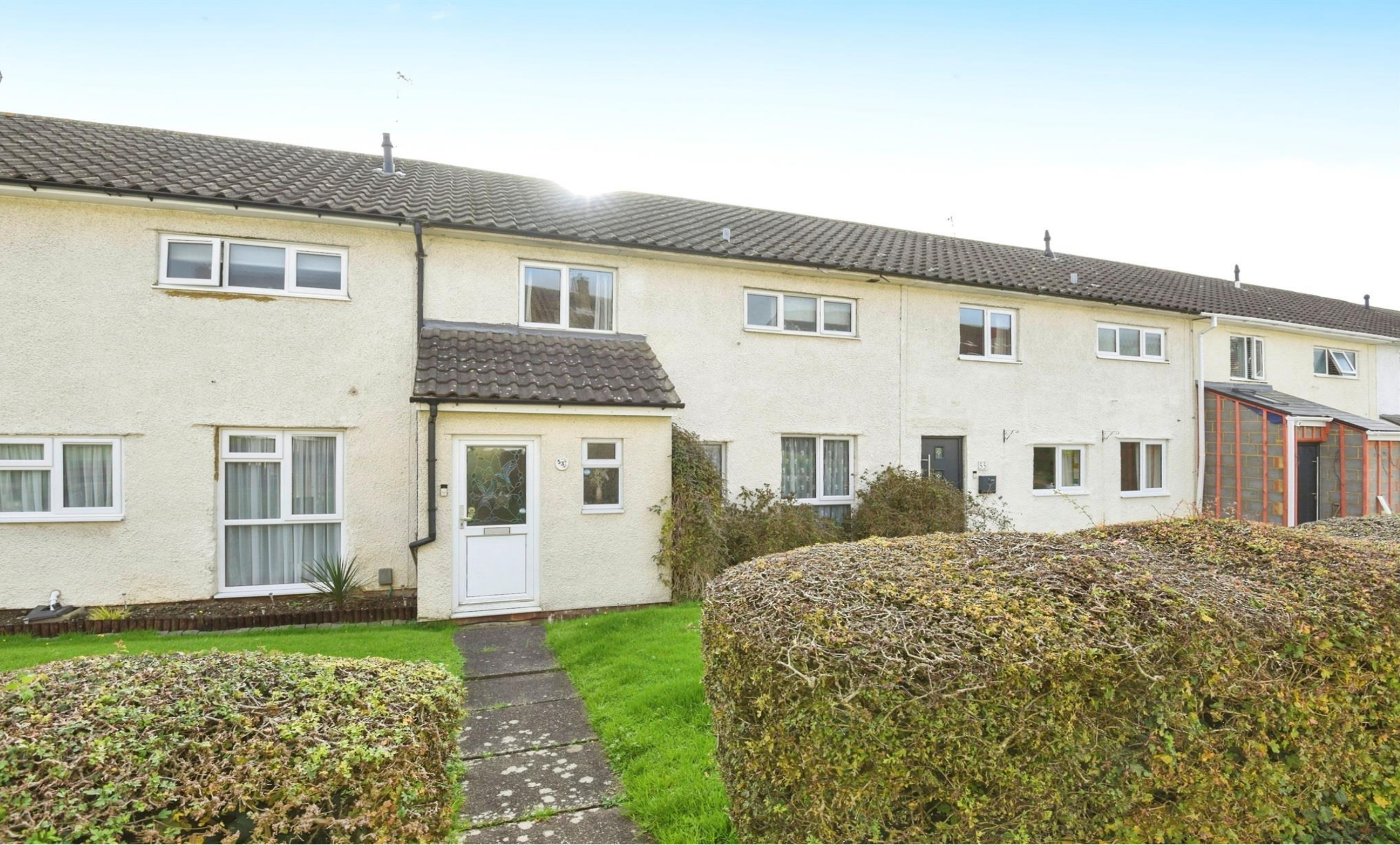
Bronte Paths, Stevenage, SG2 0PG