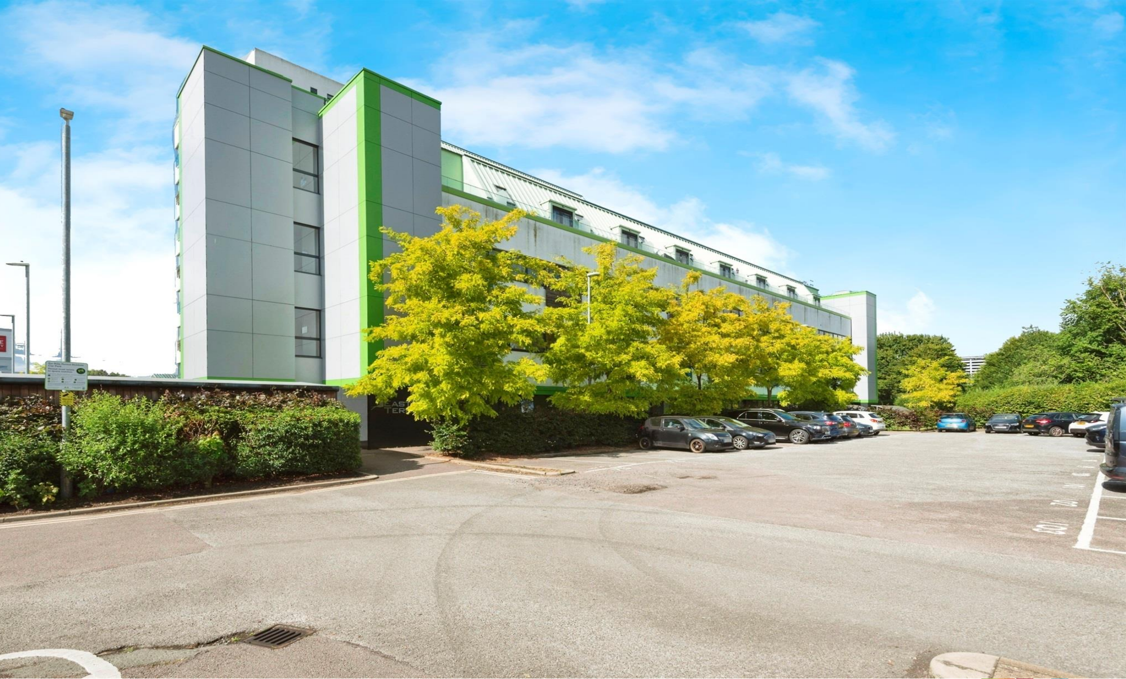
Six Hills House, Kings Road, Stevenage SG1 1AU