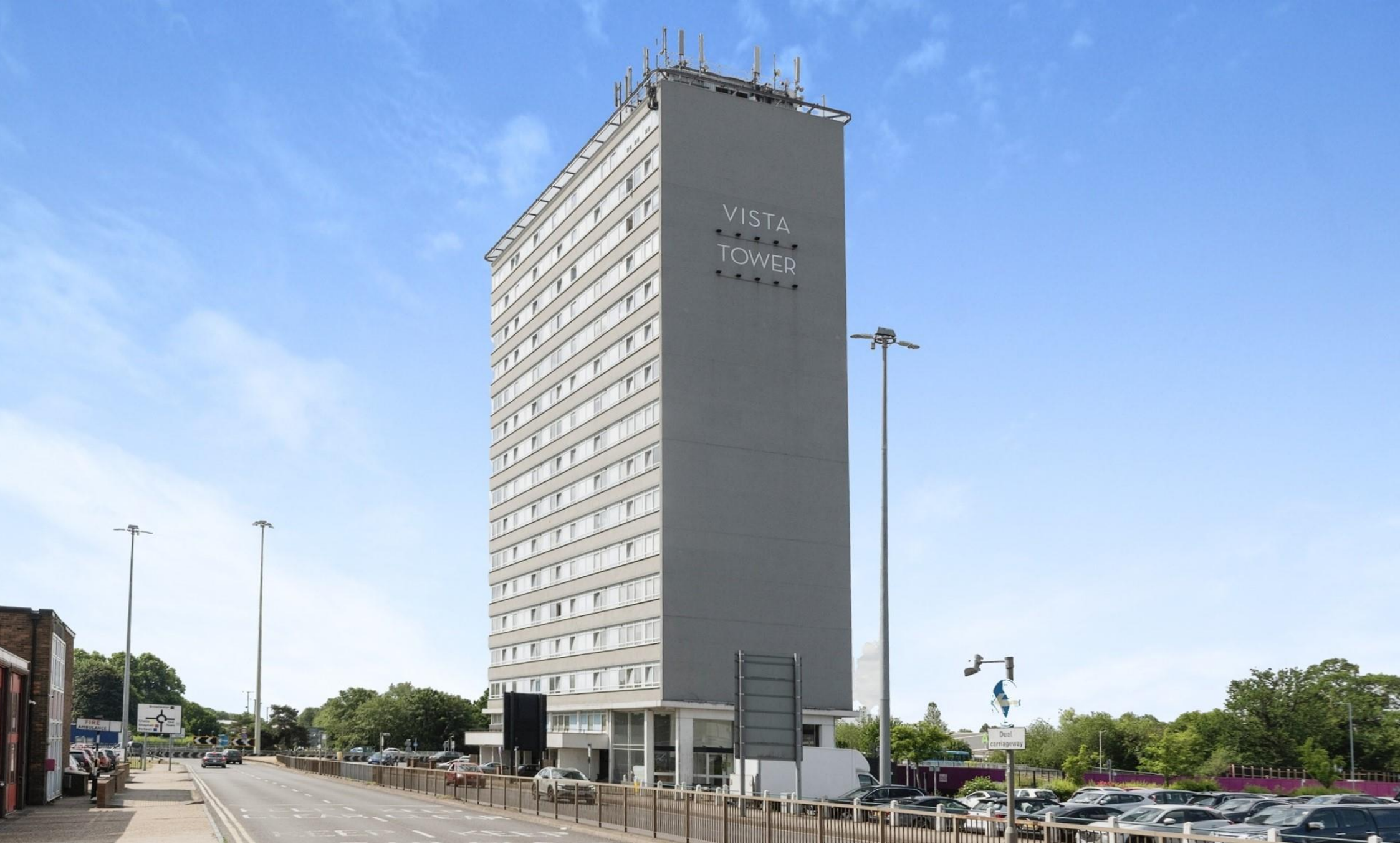
Vista Tower, Southgate, Stevenage SG1 1AR