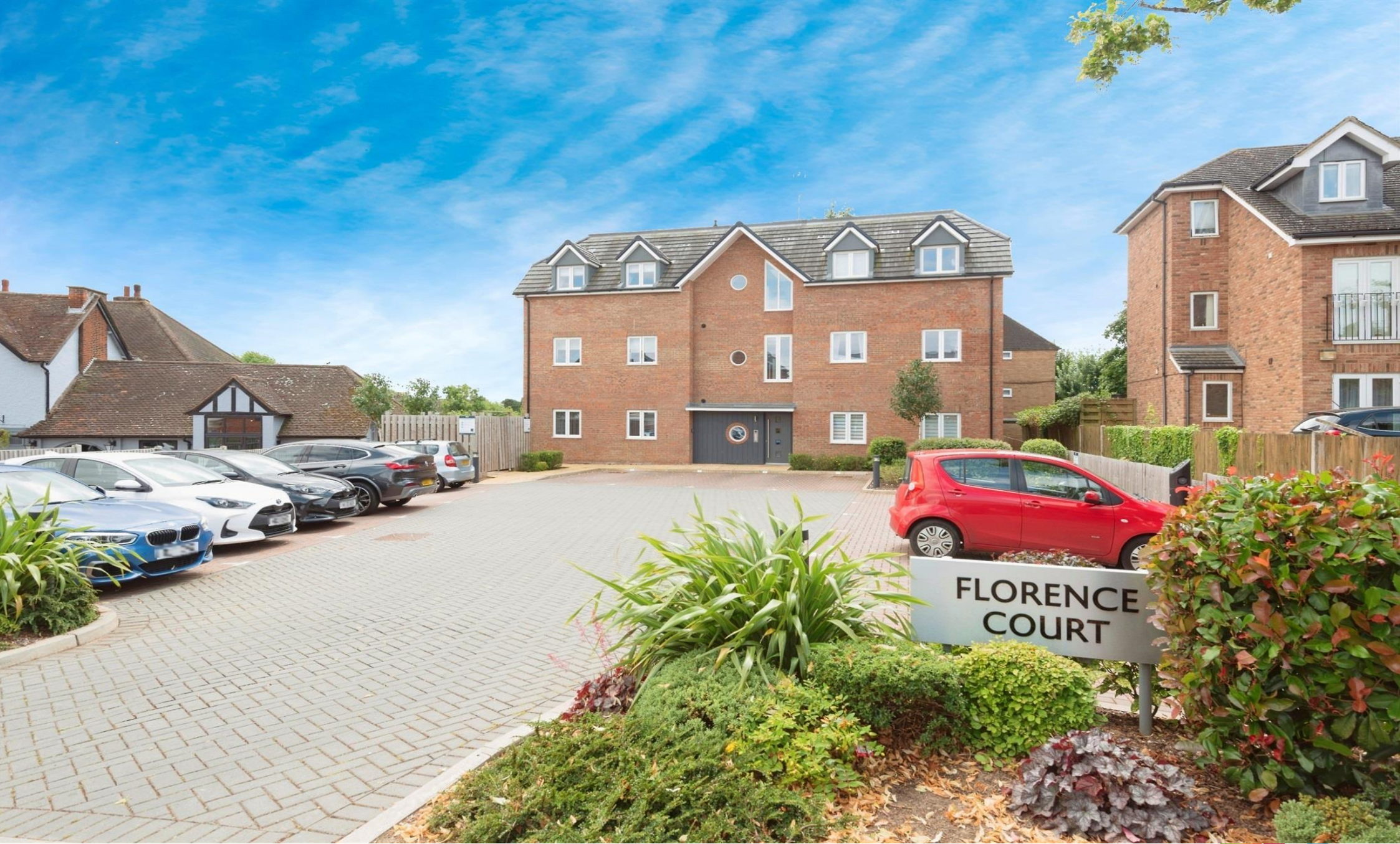
Florence Court, Park Lane, Knebworth SG3 6FQ