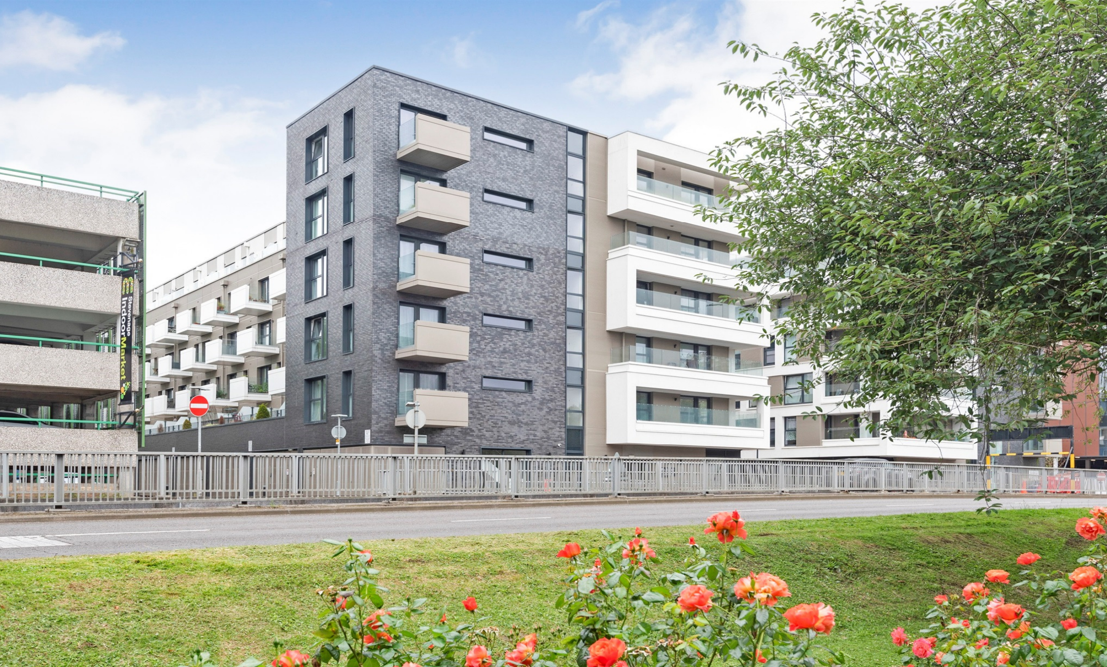
Mulberry House Park Place, Stevenage SG1 1BH