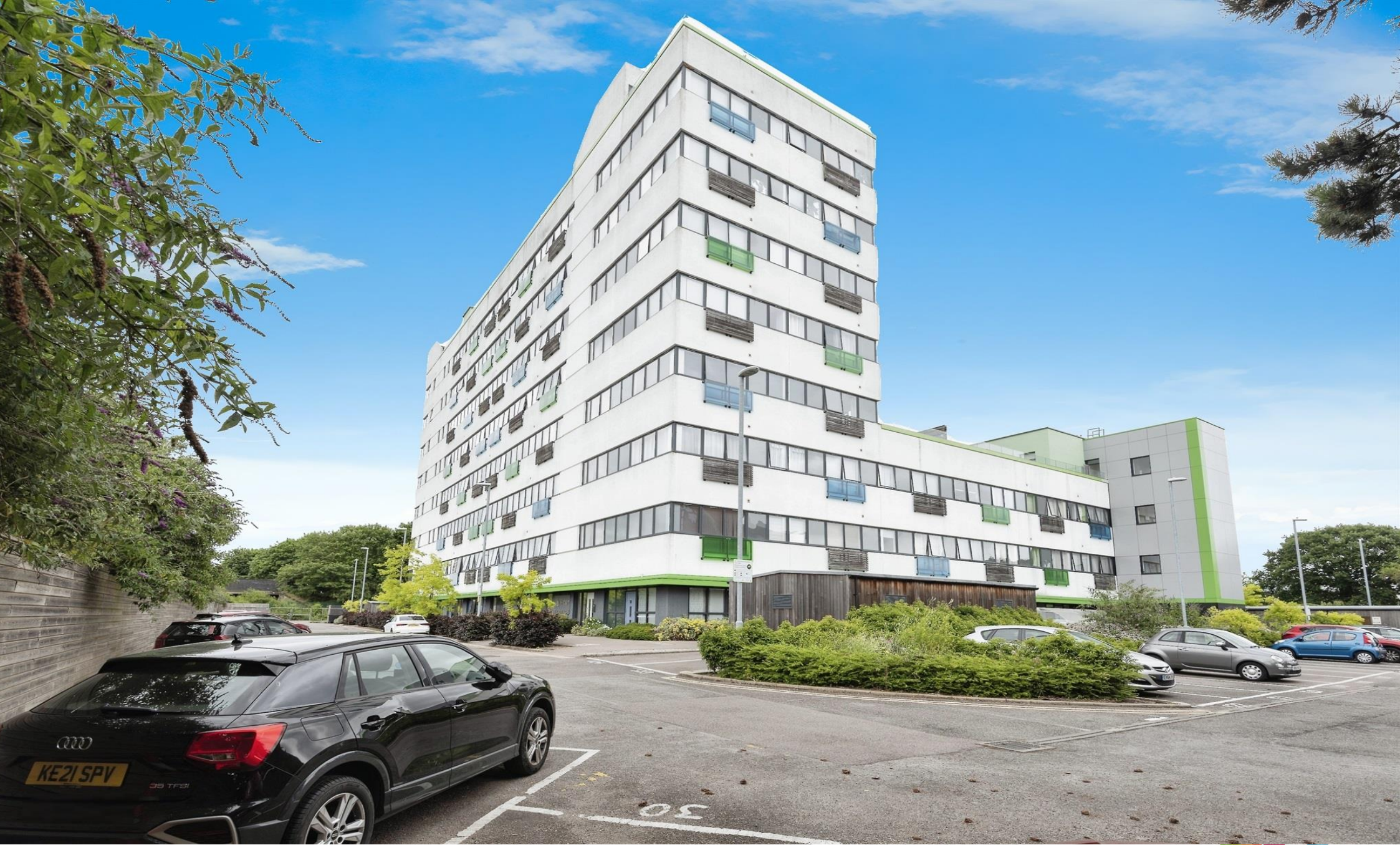
Six Hills House, Kings Road, Stevenage SG1 1AW