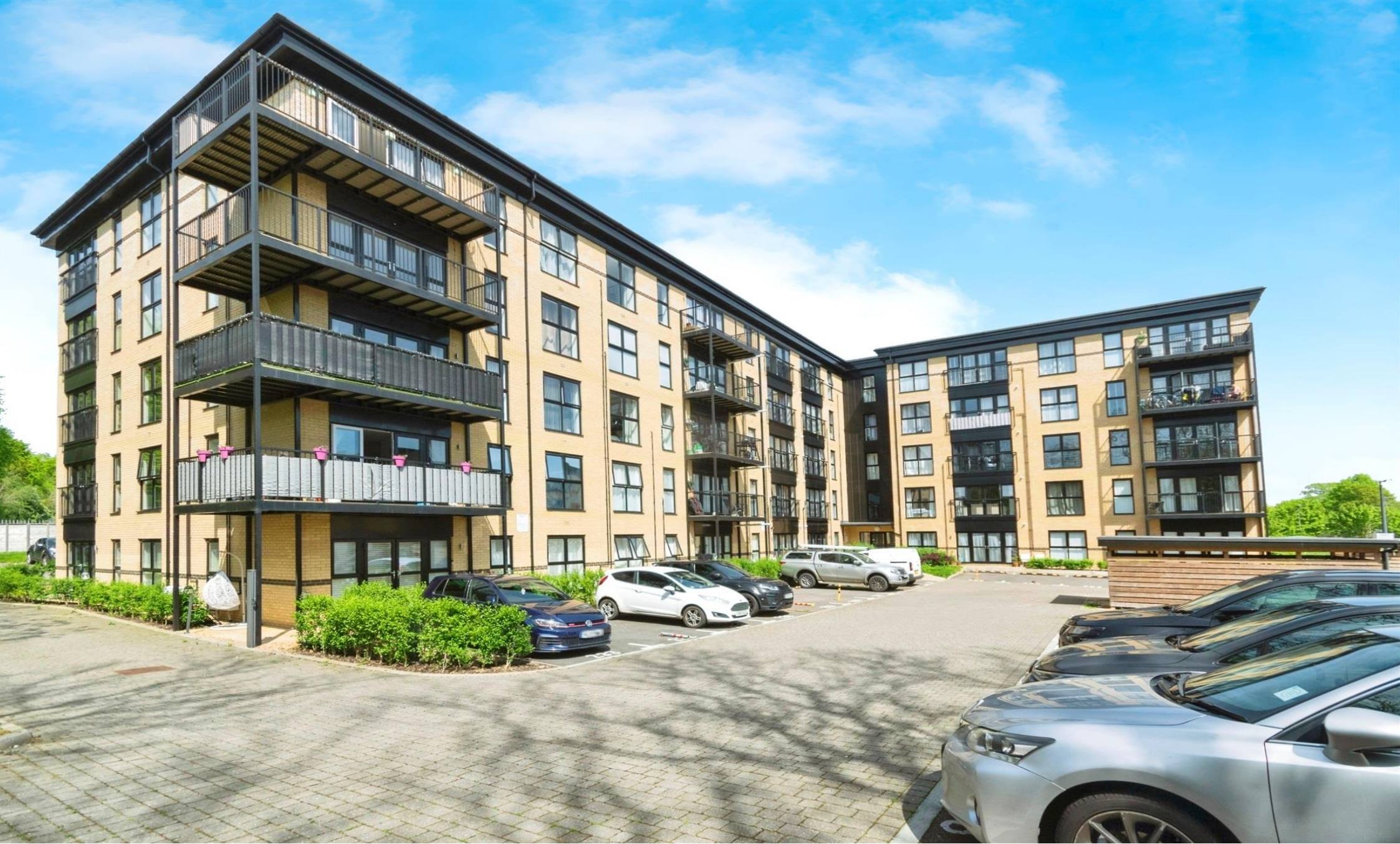
Shapiro House, Giles Crescent, Stevenage SG1 4GW