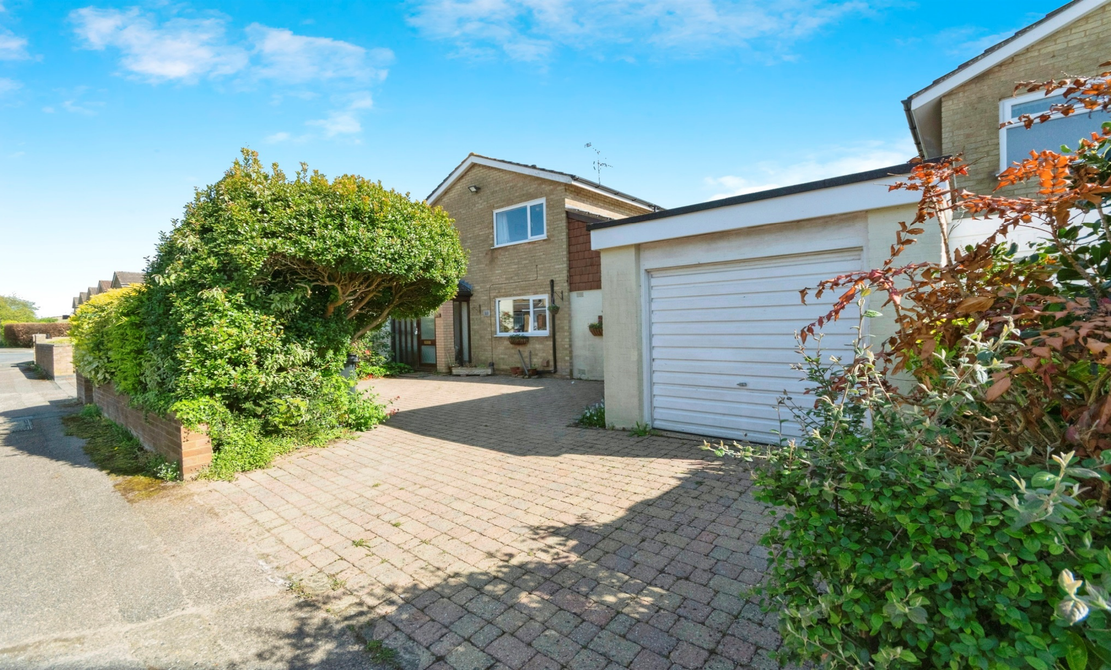
Park View, Stevenage SG2 8PS