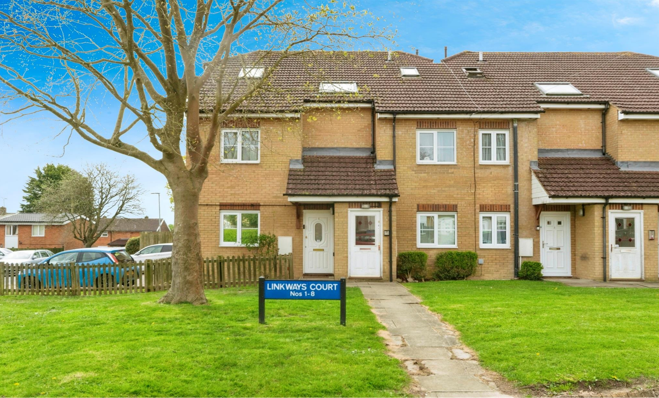
Linkways Court, Stevenage SG1 1LJ