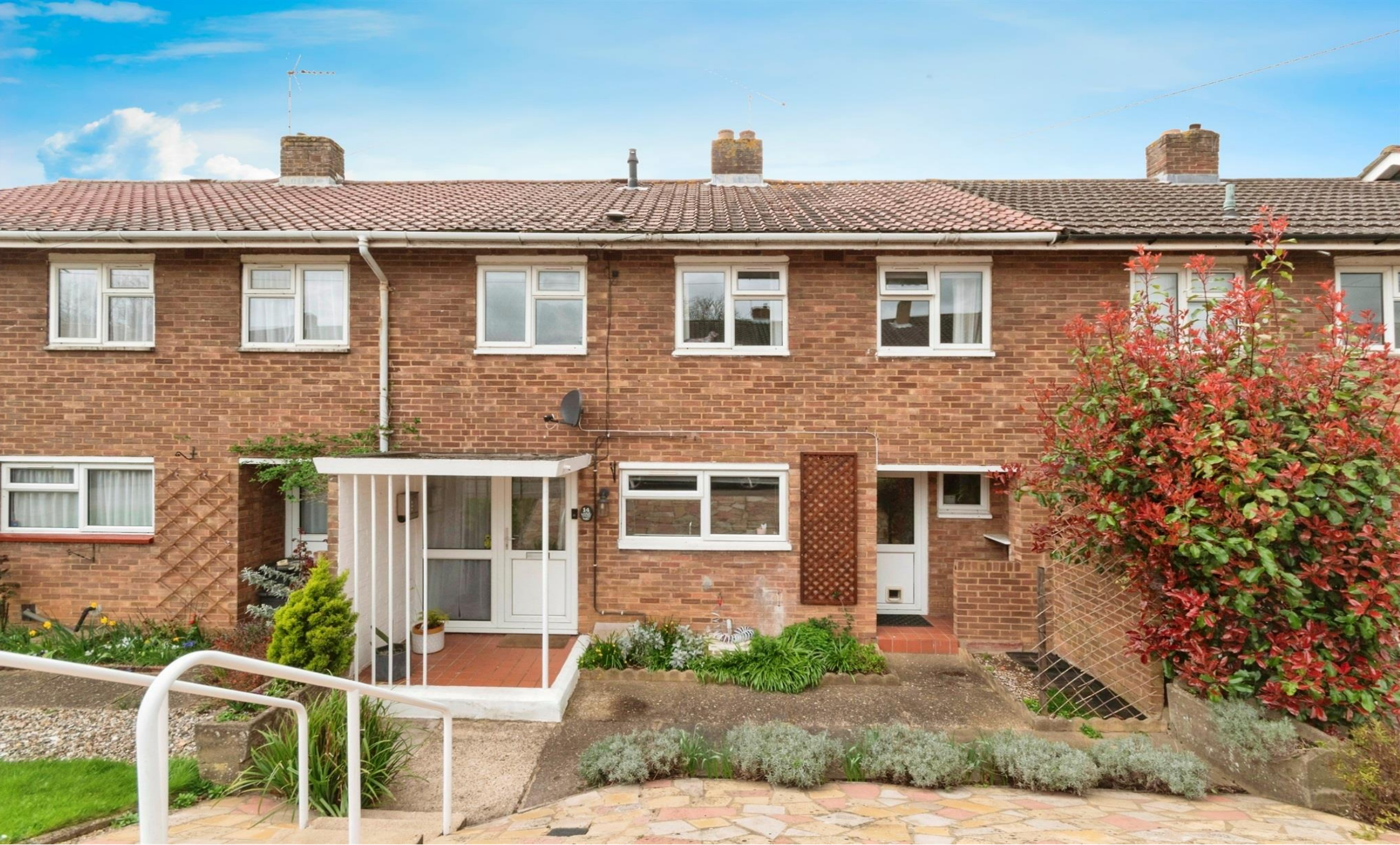
Broadview, Stevenage SG1 3TT