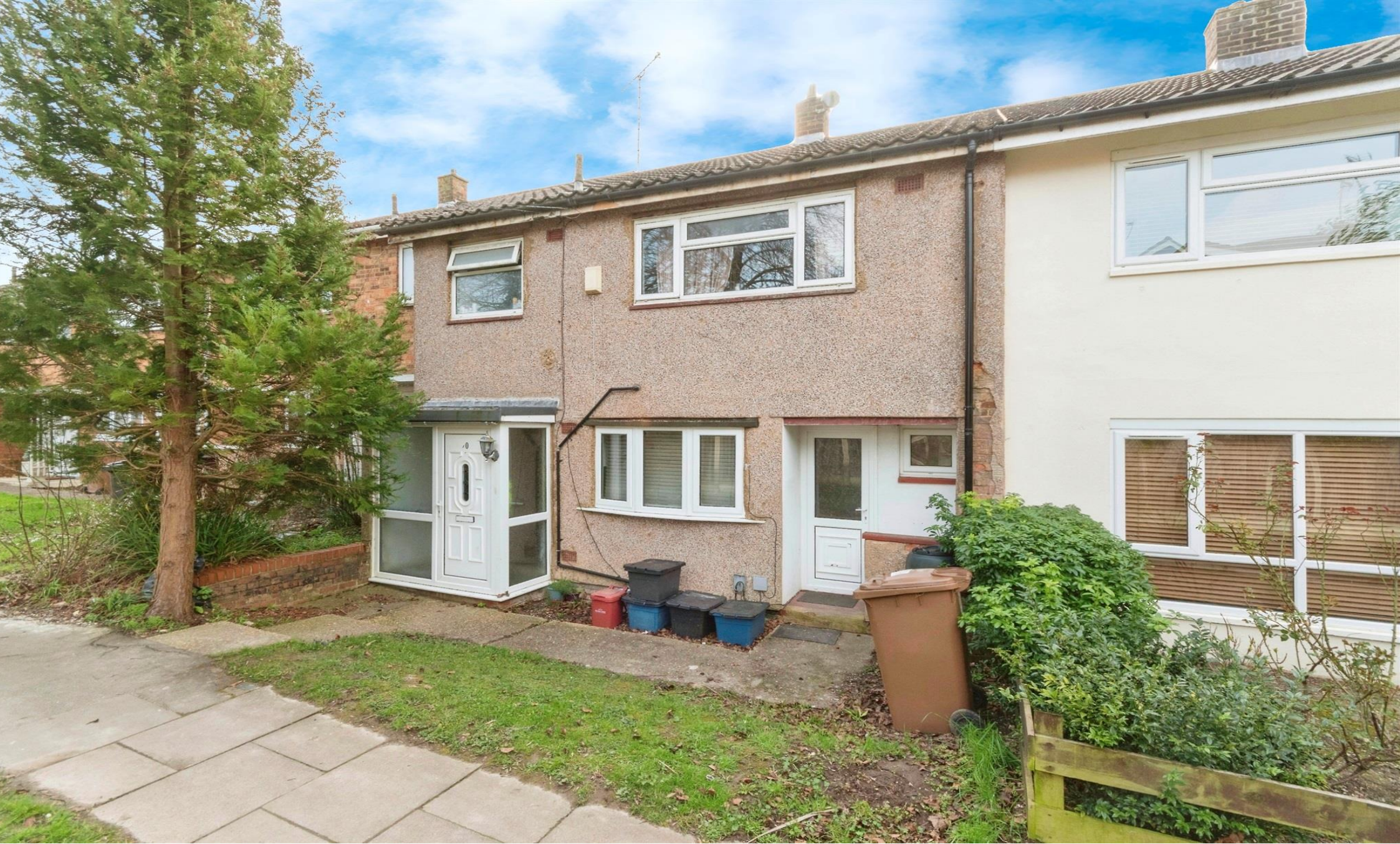
Colestrete, Stevenage SG1 1RB