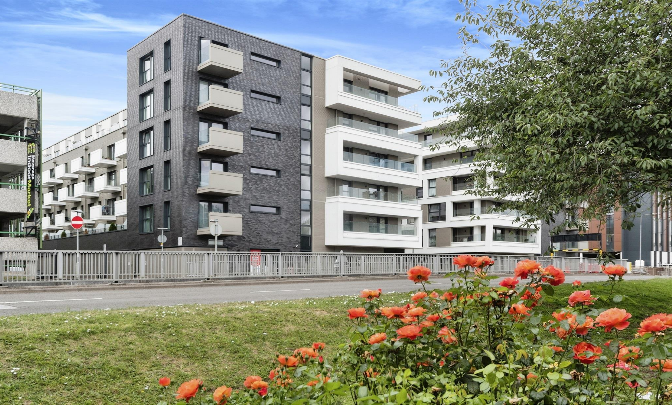
Mulberry House, Park Place, Stevenage SG1 1BH