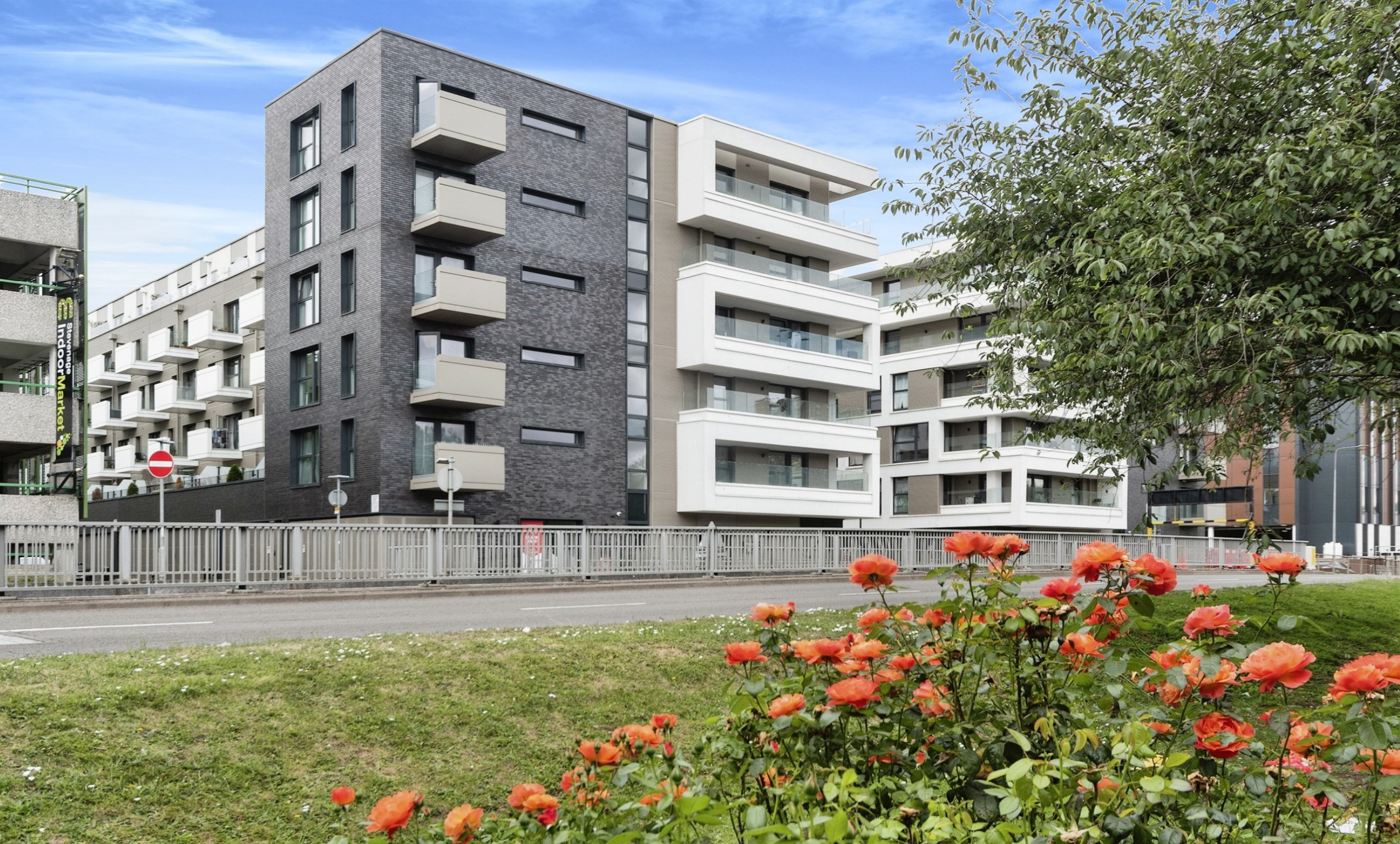
Mulberry House Park Place, Stevenage SG1 1BH