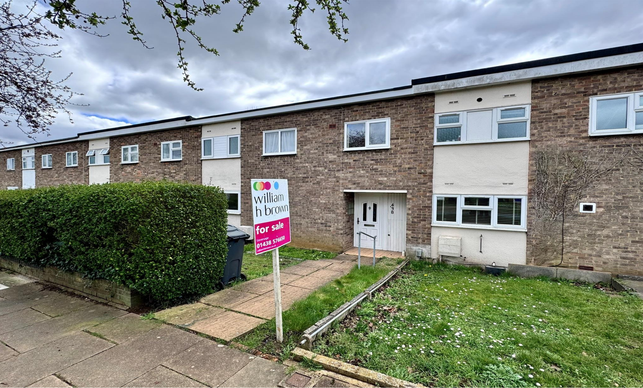
Broadwater Crescent, Stevenage SG2 8HD