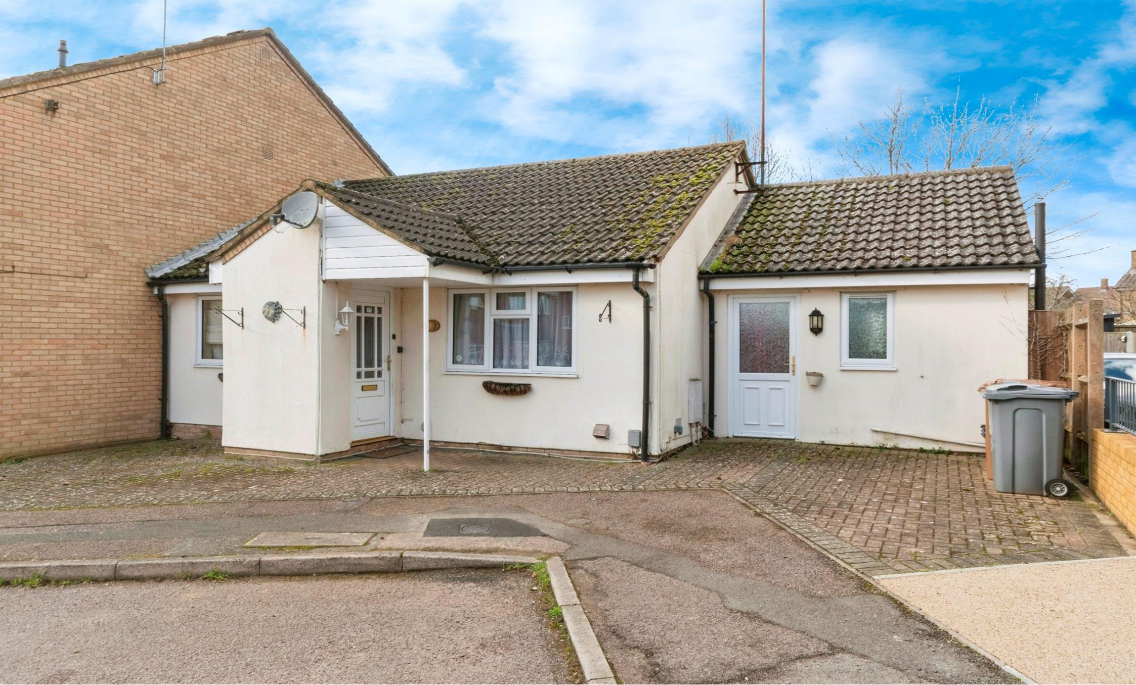
Magellan Close, Stevenage SG2 0NF