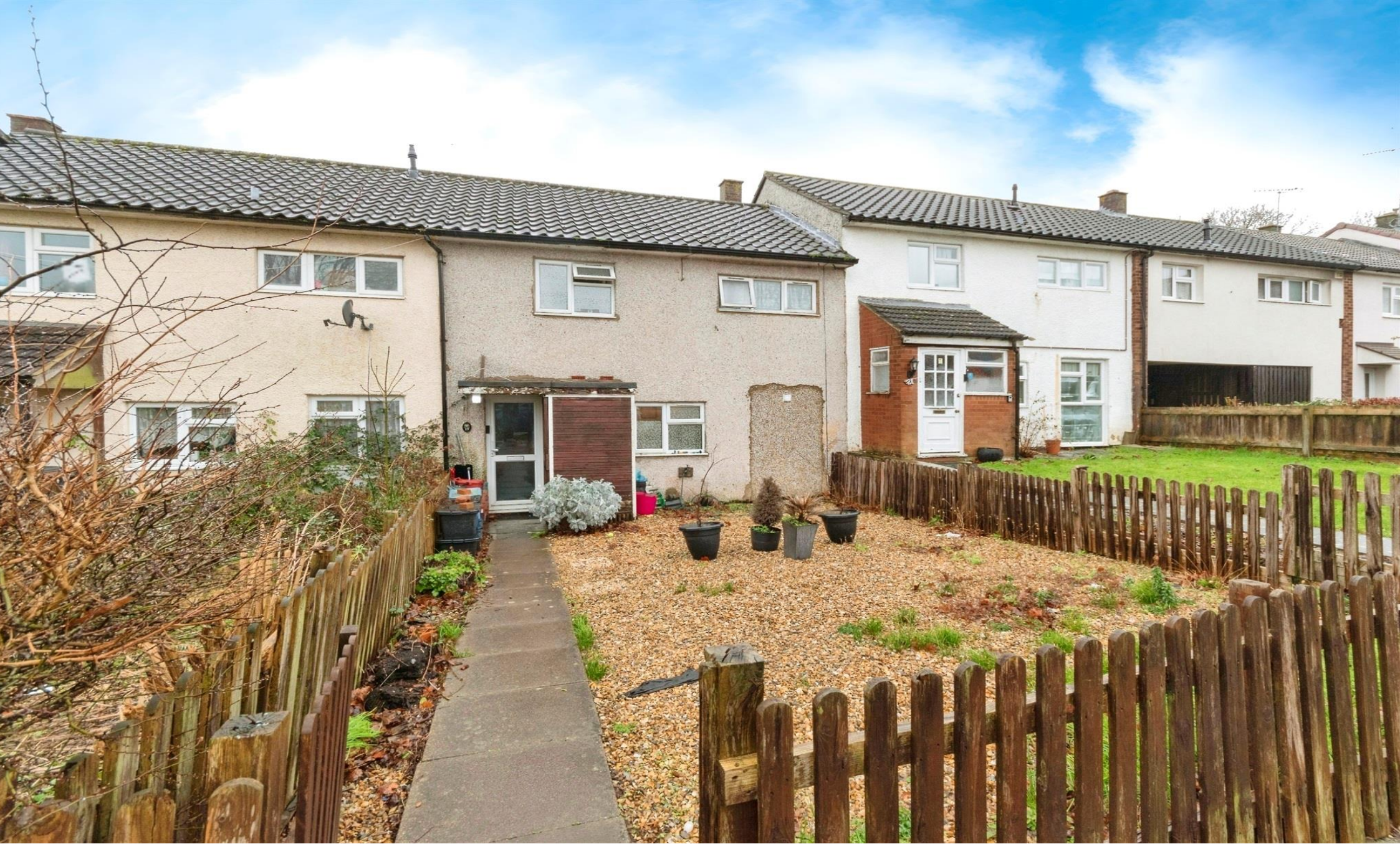
Bernhardt Crescent, Stevenage SG2 0DP