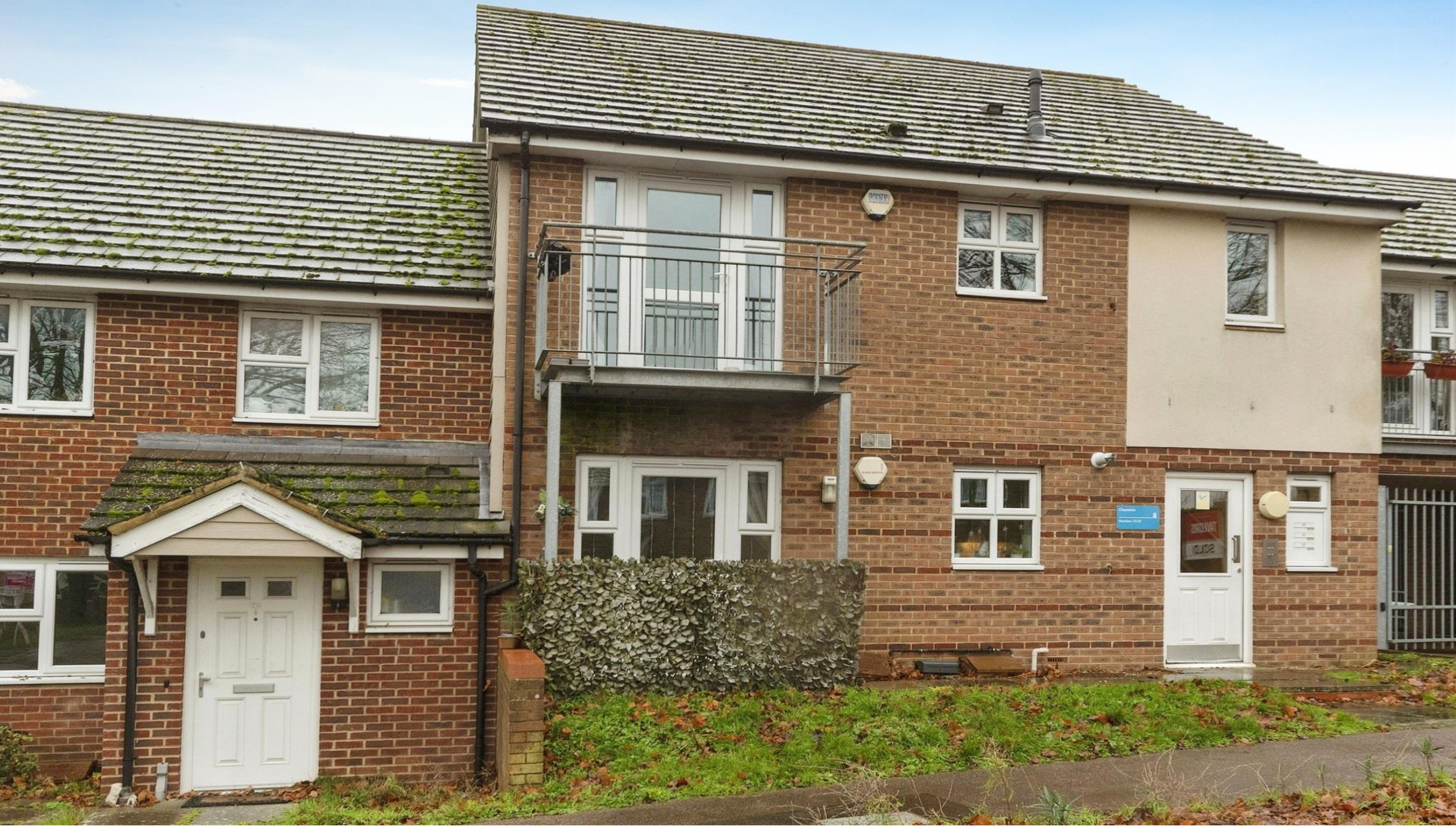
Claymores, Stevenage, SG1 3TL