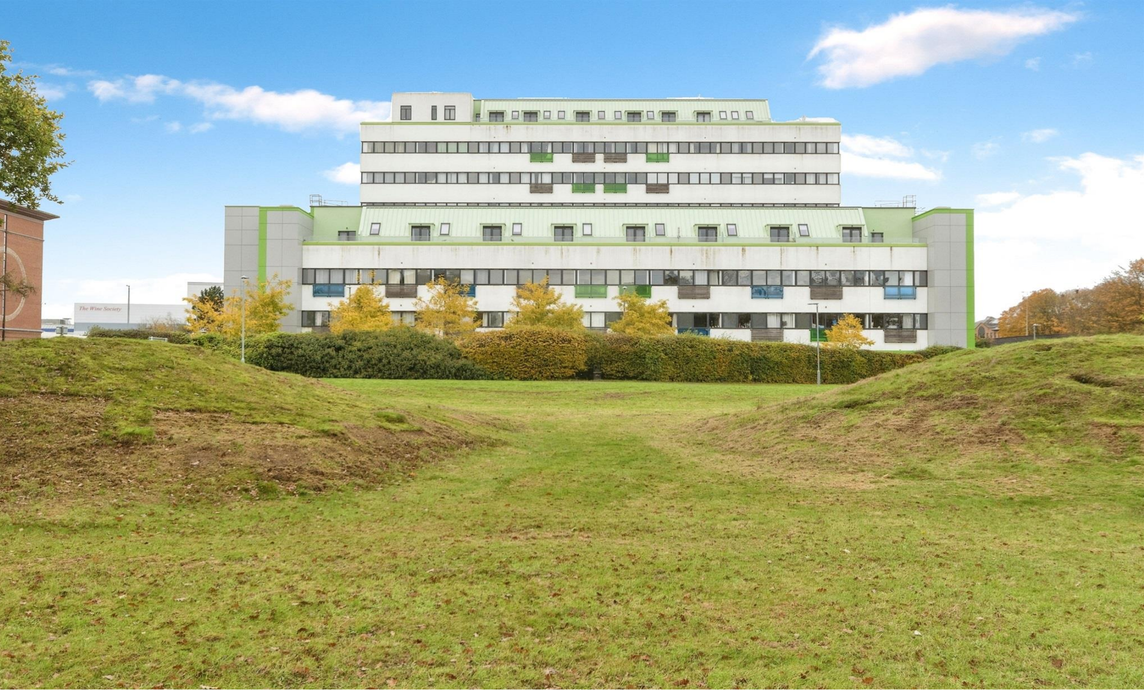
Six Hills House, Kings Road, Stevenage SG1 1AU