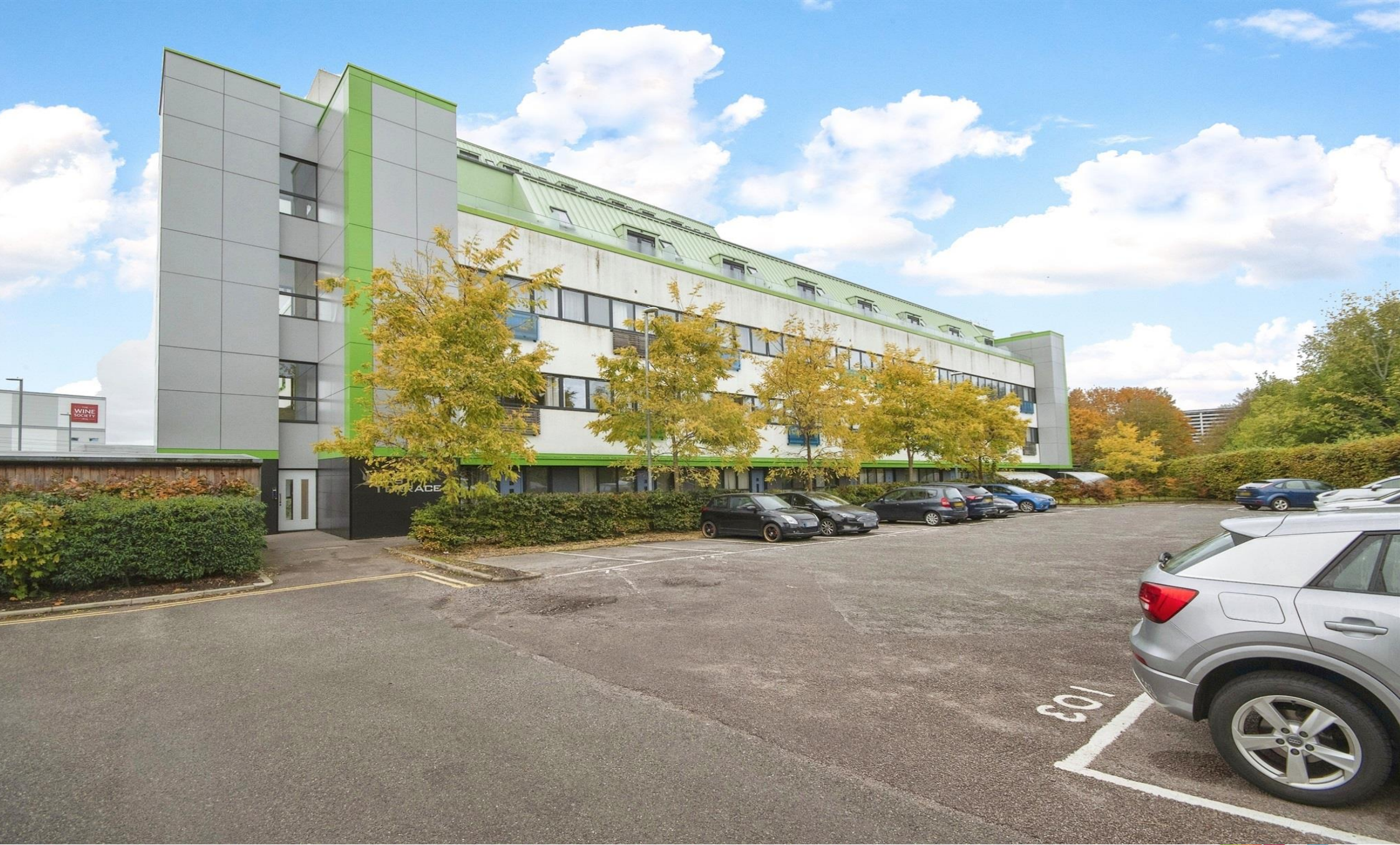
Six Hills House Kings Road, Stevenage SG1 1AU