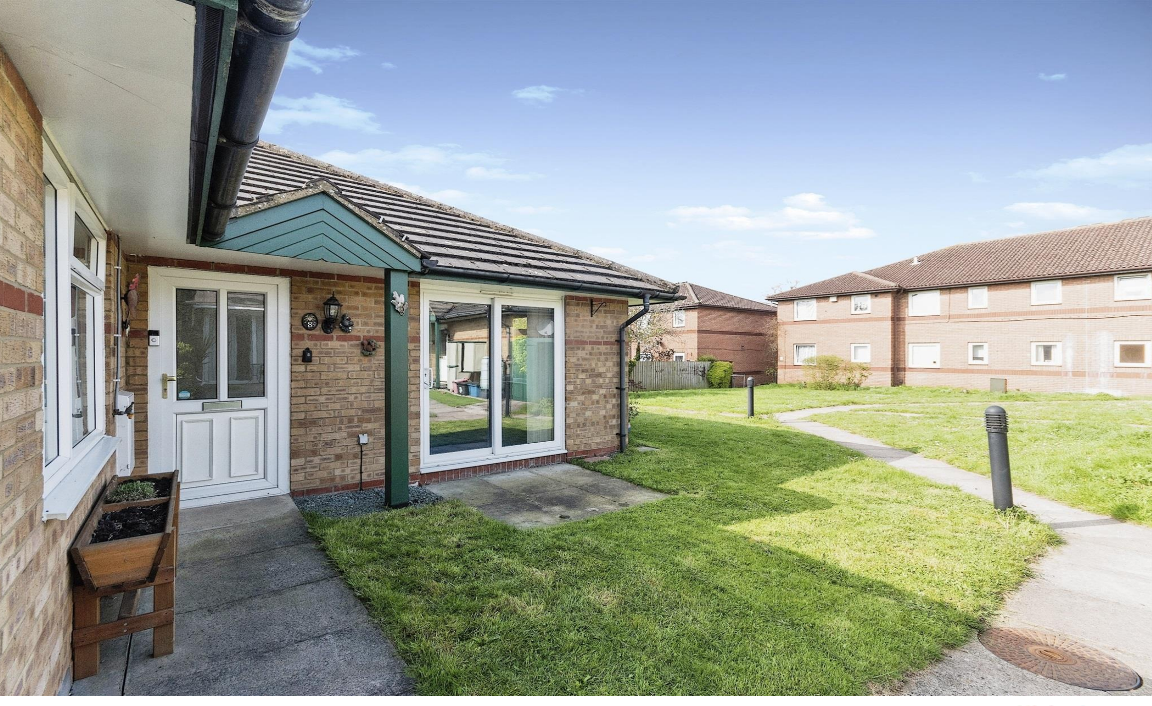
Bradman Way, Stevenage SG1 5RE