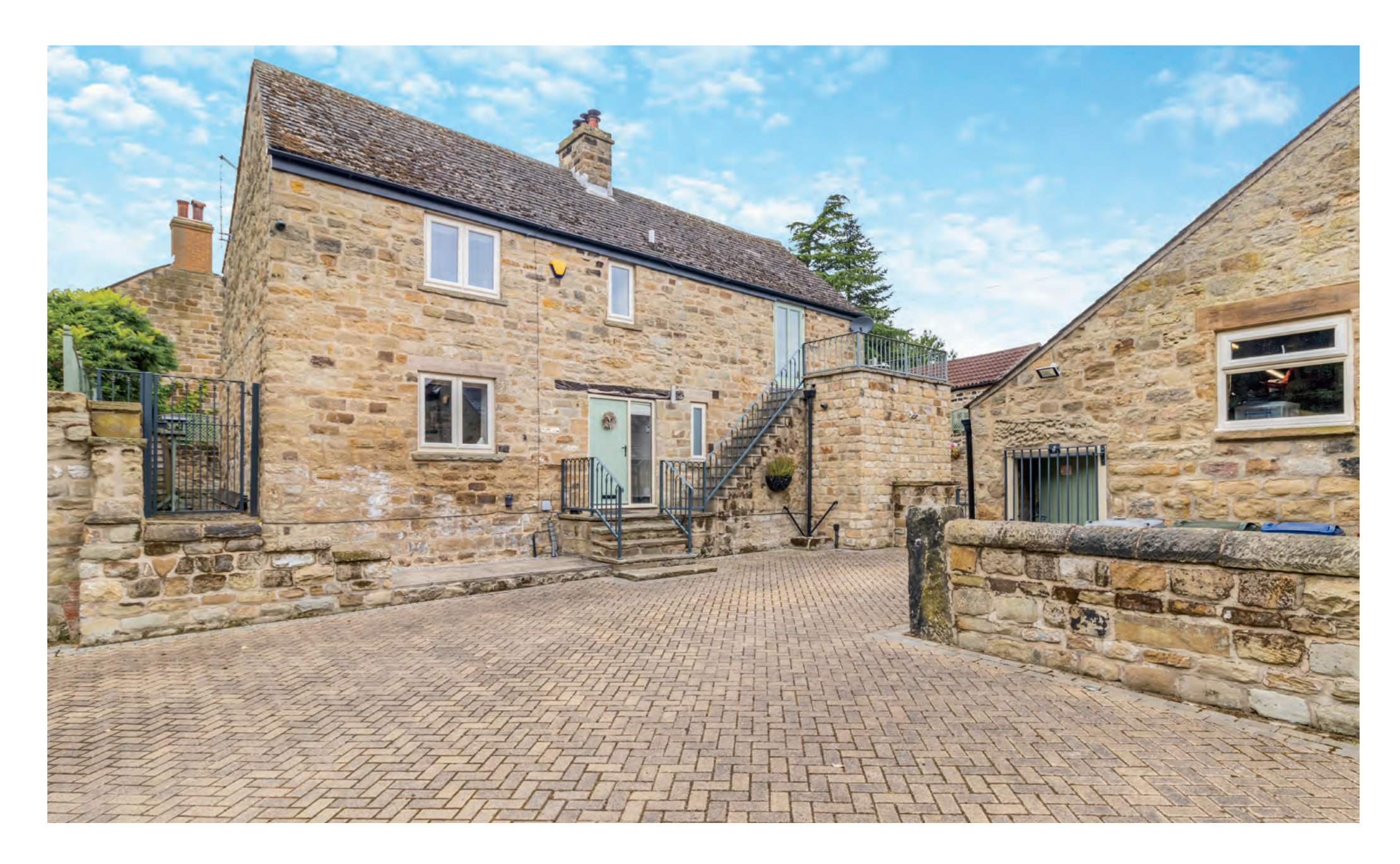
Dial House Chapel Lane | Billingley | Barnsley | South Yorkshire | S72 OHZ