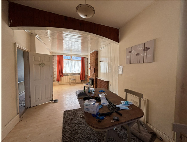
Through Living Dining