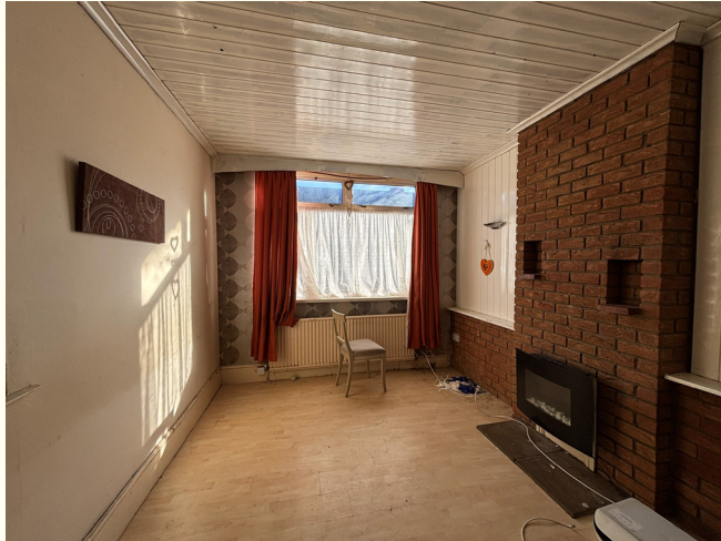
Through Living Dining