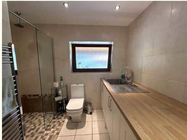
Shower and Laundry Room