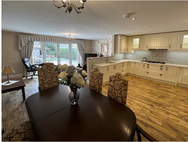
Open Plan Living Kitchen