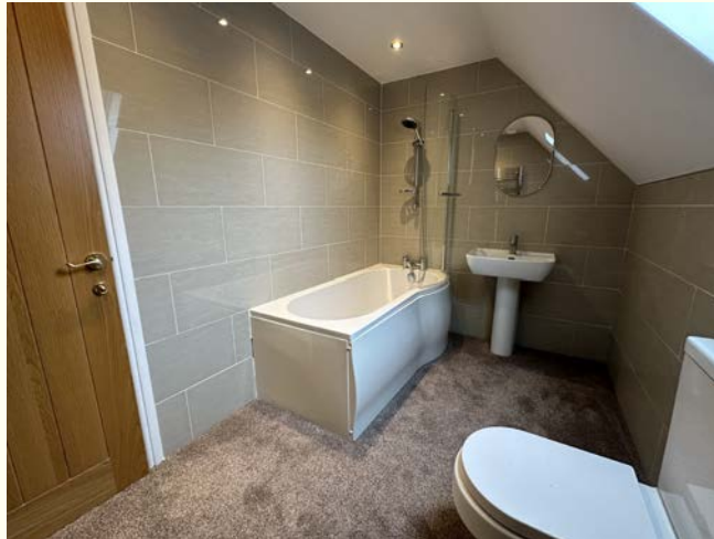
First Floor Bathroom