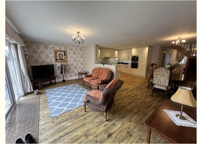
Open Plan Living Kitchen