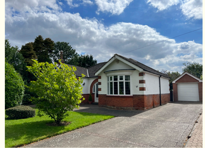
Driveway & Garage