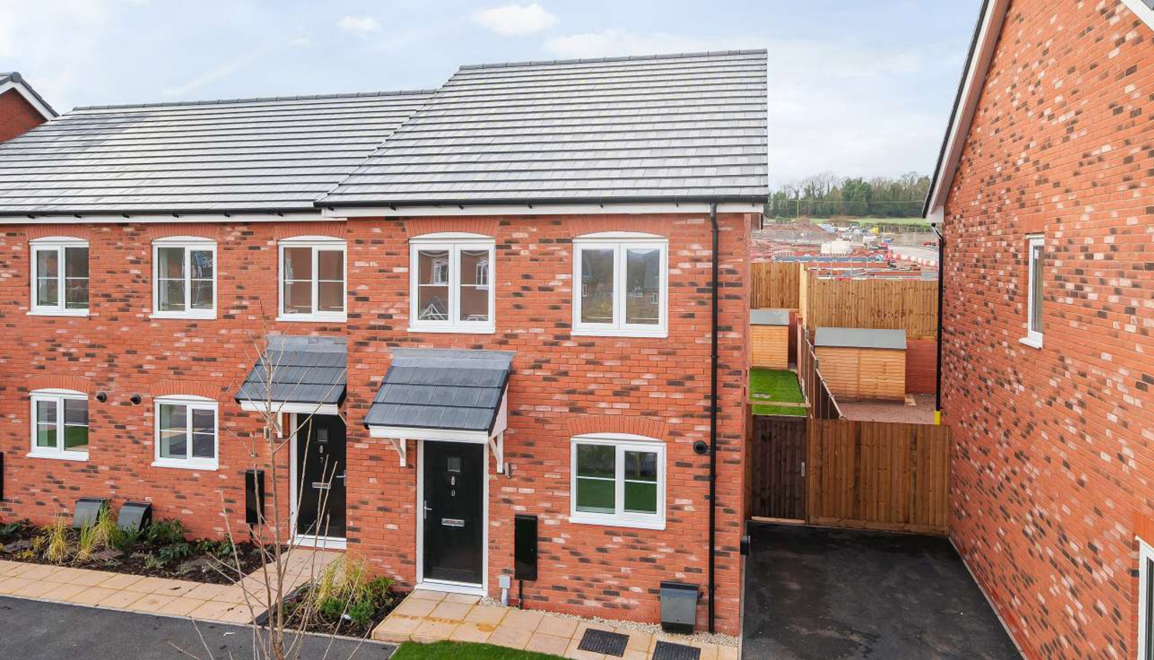
Plot 15, 20 Calluna Road Kidderminster DY11 6FH