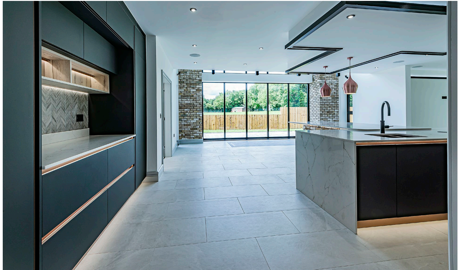
These photos are representative of other Damson Homes properties

Broughton Place exemplifies this attention to detail, offering superior finishes, premium appliances, and top-tier sanitaryware throughout—hallmarks of the Damson brand. The kitchen is a testament to this, combining functionality with elegance. With luxurious countertops, soft-close cabinetry, and cutting-edge appliances, every element has been chosen to achieve the perfect harmony of beauty and practicality.