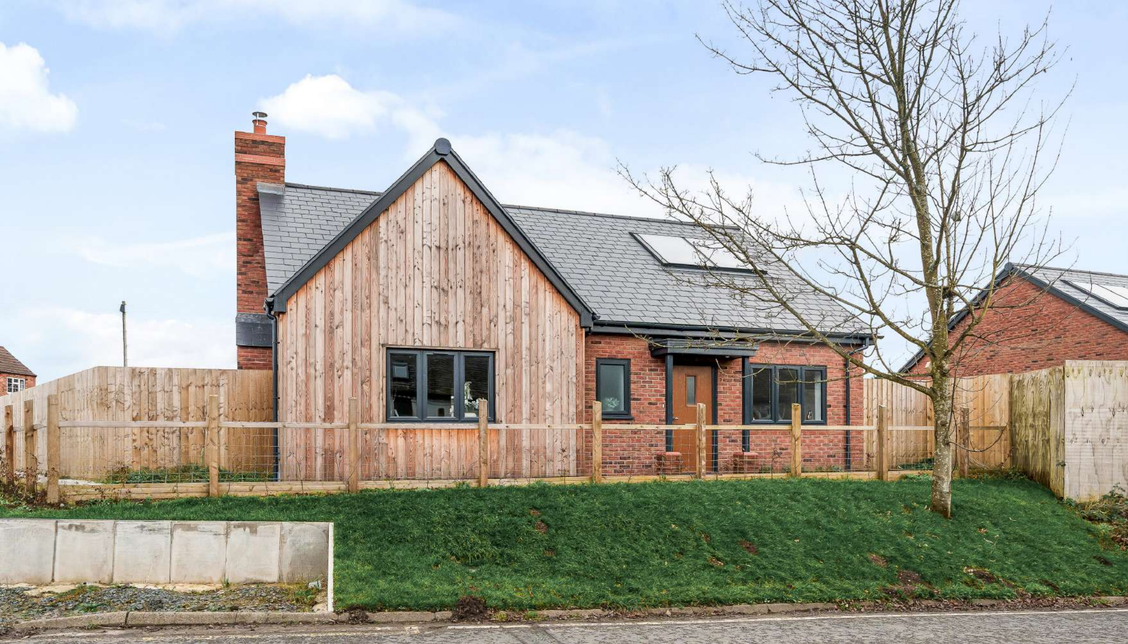
1 Victory Hall Court Clows Top, DY14 9AJ