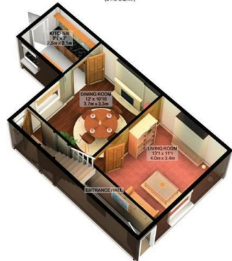
GROUND FLOOR APPROX. FLOOR AREA 401 SQ.FT. (37.2 SQ.M.) TOTAL APPROX. FLOOR AREA 743 SQ.FT. (69.0 SQ.M.)

For illustrative purposes only. Decorative finishes, fixtures, fittings and furnishings do not represent the current state of the property. Measurements are approximate. Not to scale. Made with Metropix ©2018