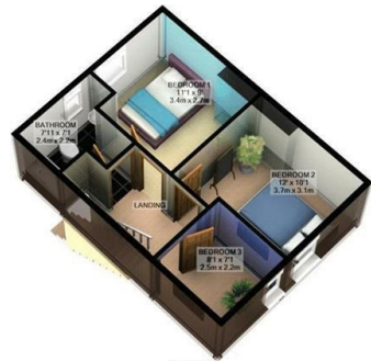
1ST FLOOR APPROX. FLOOR AREA 342 SQ.FT. (31.8 SQ.M.)