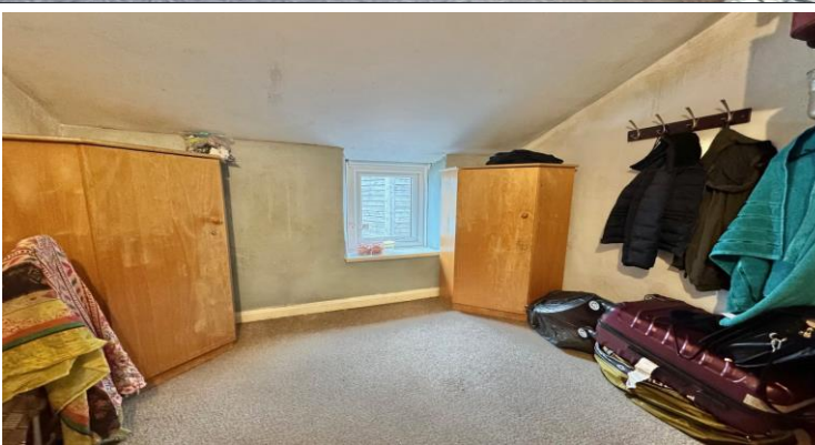
Our View "Very conveniently situated property which would make an ideal first buy or investment"

A two bedroom period property with a courtyard garden situated in the heart of Newton Abbot town centre.