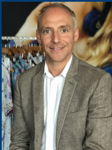
Mark Tweed Cyber Jammies

"Waterhouse ticks all the right boxes. Cost is incredibly important - that was the starting point. The business support - having the phones set up and parcels delivered when I'm away from the office - is a big help."