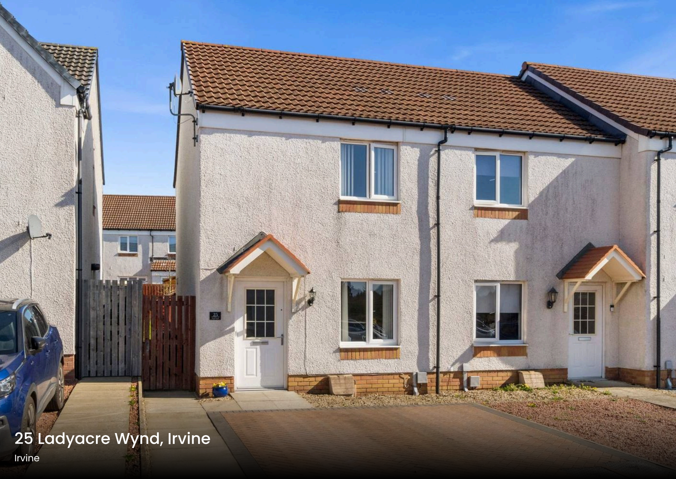
25 Ladyacre Wynd, Irvine Irvine