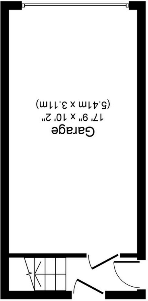
Ground Floor 219 sq. ft. (20.4 sq. m.)